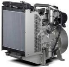
PERKINS Engine 1106A-70TAG2