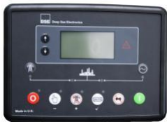
DSE6120 MKII AUTO START & AUTO MAINS FAILURE CONTROL