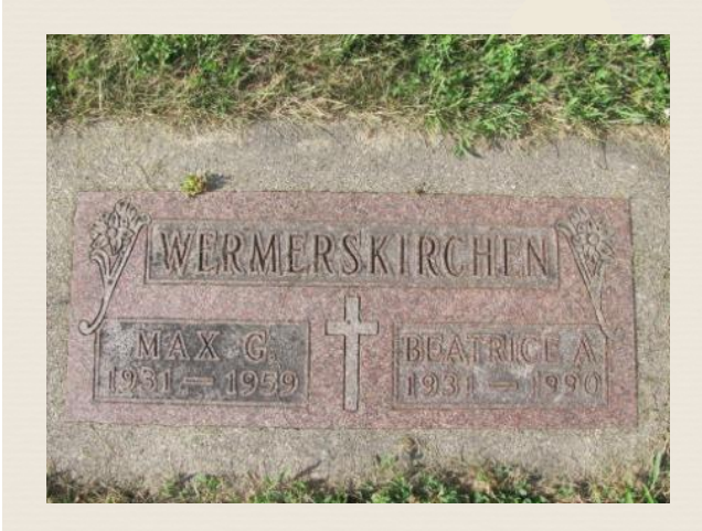
Max Wermerskirchen is at the Catholic Cemetery in Shakopee.