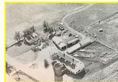
The family farm near Marystown, Minnesota.