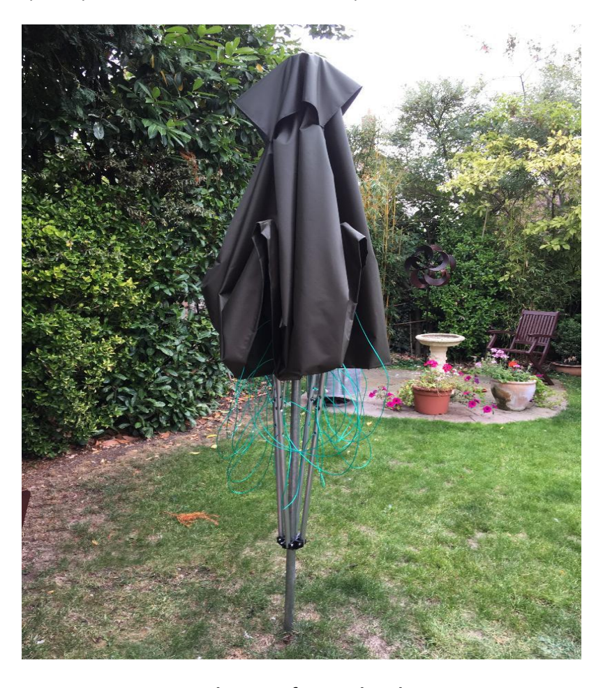
Ready to use for another day.

Keeping your thumb pushed on the Ratchet Pulley Catch, allow the Bottom Hub to slide down the central pole until your SyDri Standard Airer is in a closed position.