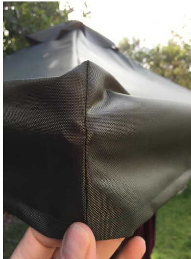
Pull in a downward direction