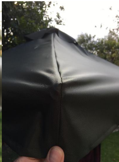
Slides over the end of the rod