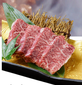
Black Angus Harami Skirt