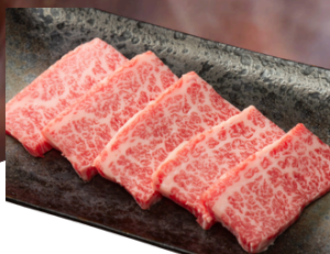
Black Angus Prime Boneless Short Rib