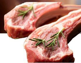
Grass-Fed Lamb Rack (1pcs)