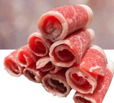
Black Angus Yaki Shabu Brisket