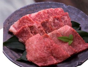
Black Angus Beef Tongue