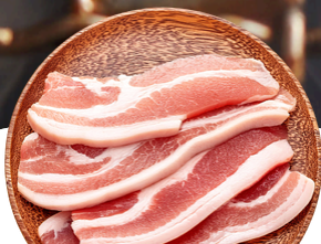
Kurobuta Pork Belly