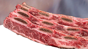
LA Style Galbi (bone- in short rib)