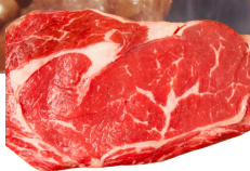
Black Angus New York Steak