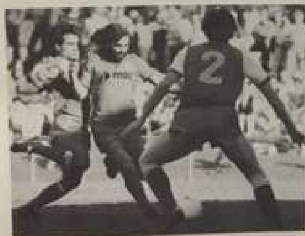
George Best in action for Brisbane Lions.

Even the signing of former Manchester United and Ireland star, George Best, for three guest appearances failed to produce any improvement in Lion's performances. Best showed occasional glimpses of his old ball skills, but his work-rate was very low.