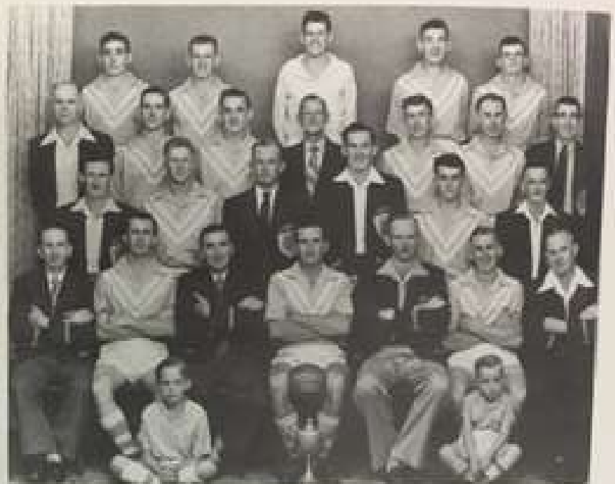
Bundamba Rangers, Premiers 1955

The loss of so many top players had a dramatic effect on the Ipswich clubs. Not only did results suffer, but clubs were forced to merge. Bush Rats joined Redbank to form Redbank-Diamore. In 1964, Blackstone and Bundamba merged to form Coalstars and two years later, in April 1966, Redbank-Diamore merged with their new