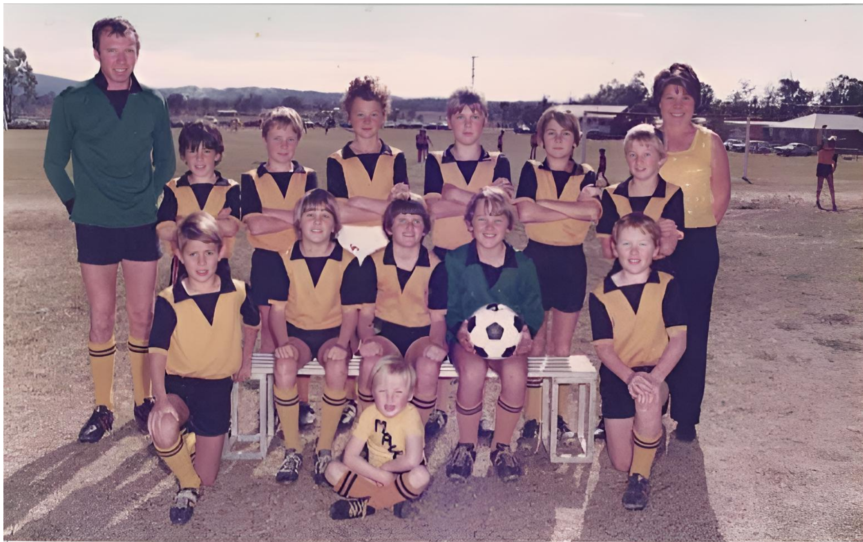
UNDER 11 – 4TH DIVISION TEAM