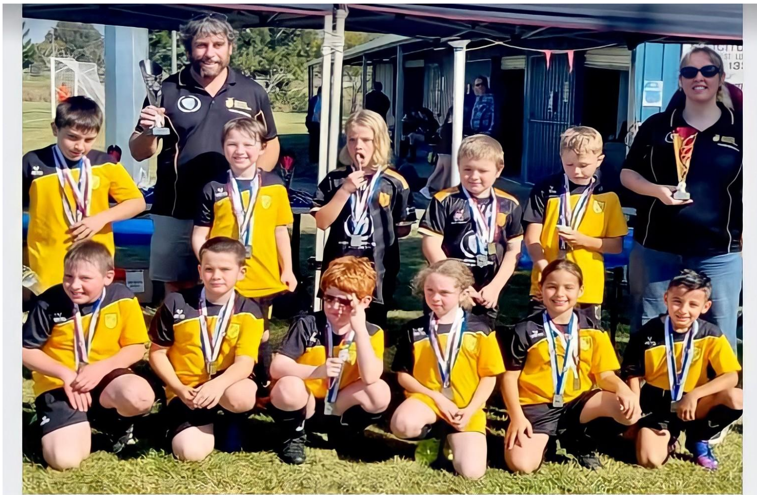
-2021- Under 9