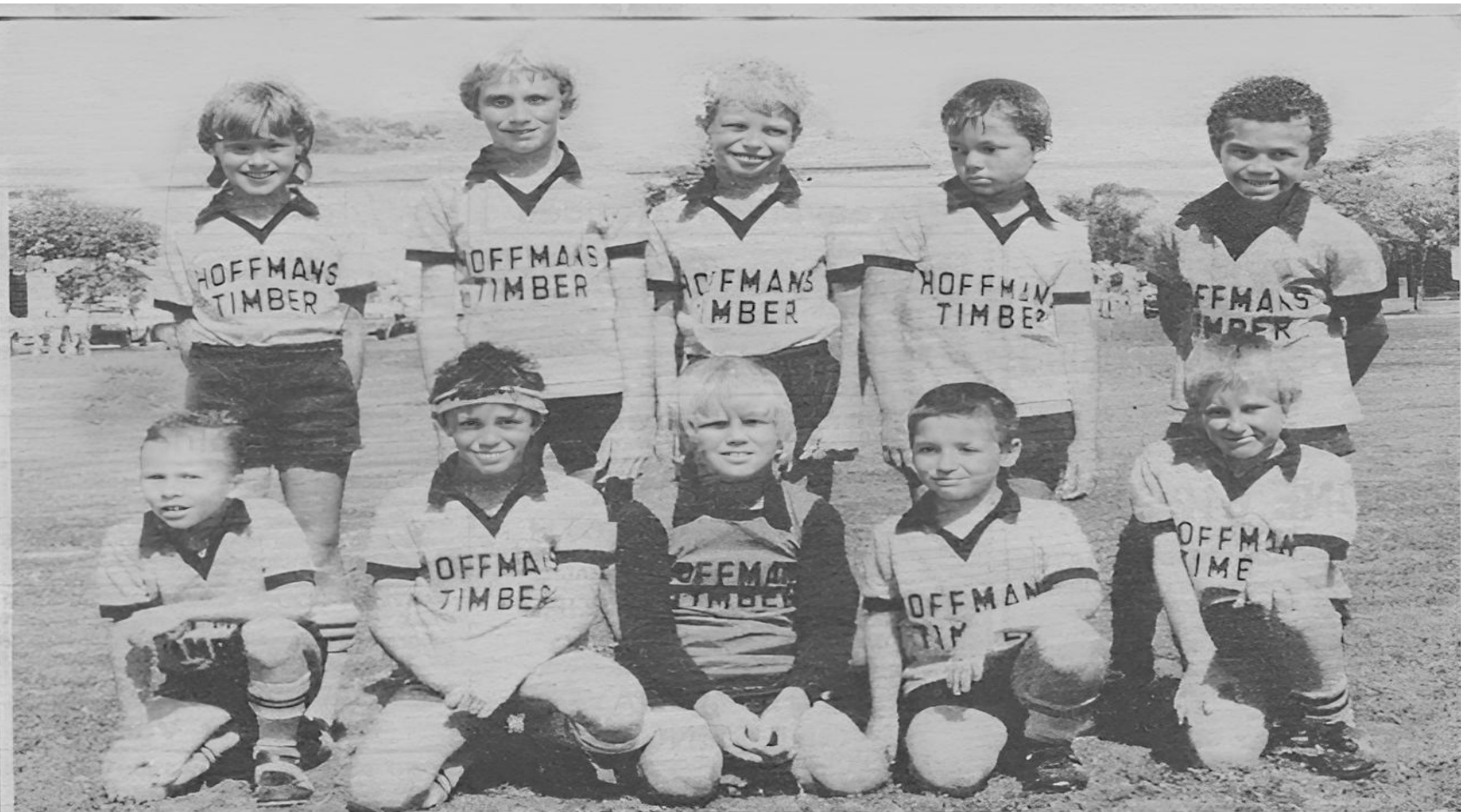
• The mighty Under 9 Bushrats