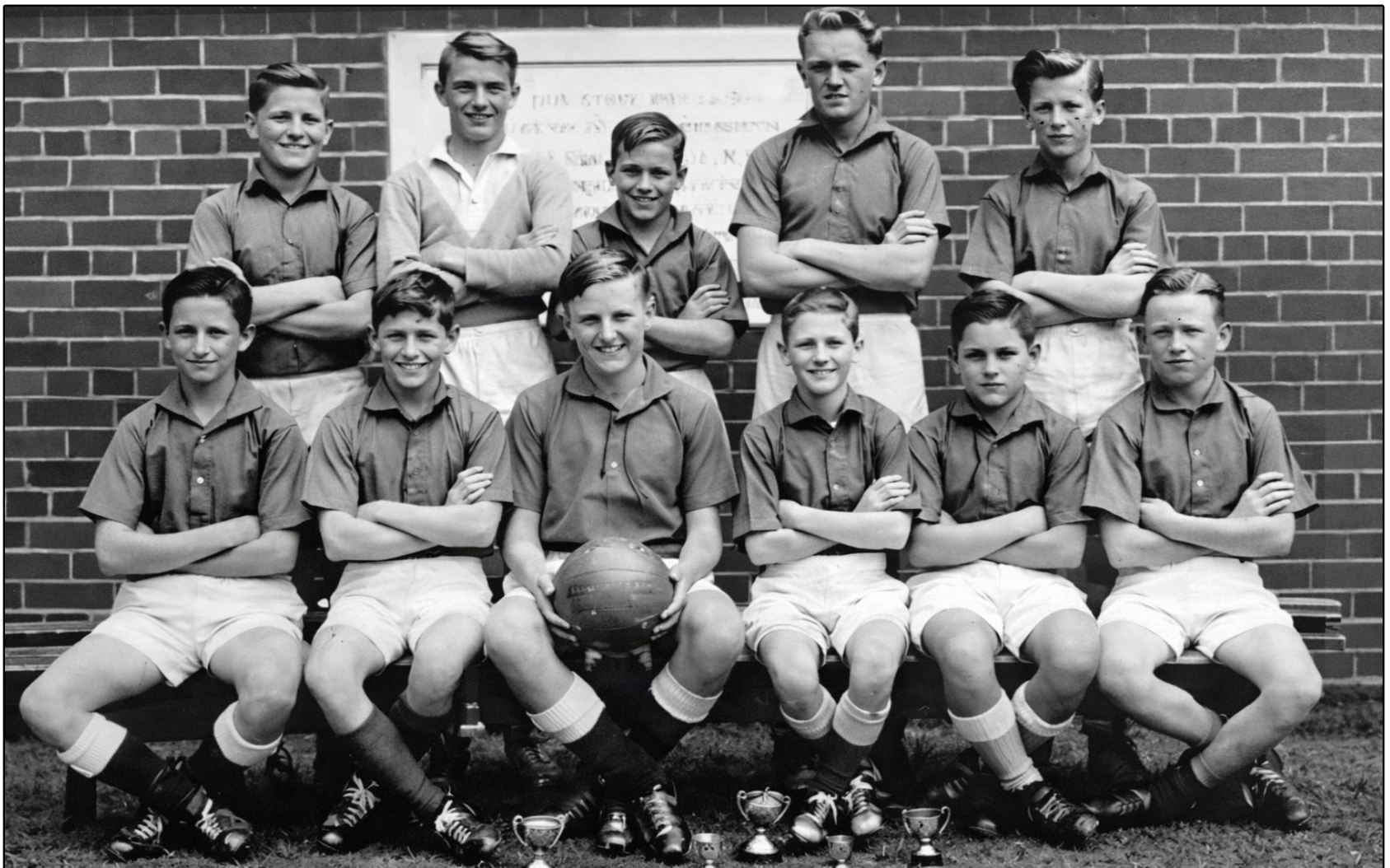
-1956- Silkstone State School