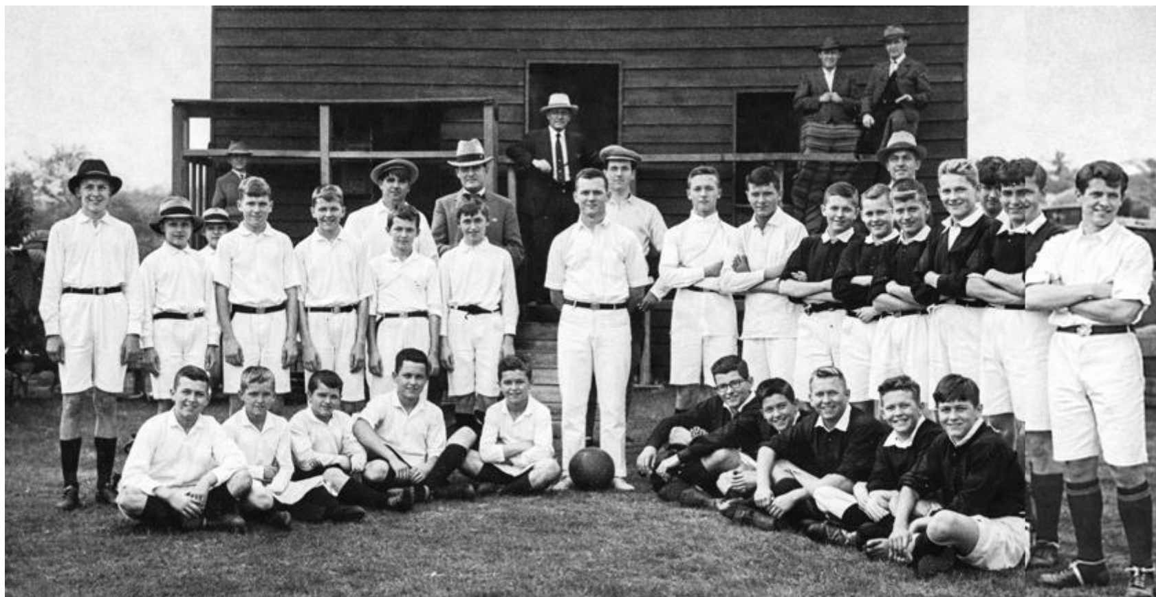
THE RIVAL TEAMS, BRISBANE (WHITE SHIRTS) AND IPSWICH (DARK SHIRTS), who played an interesting match at Bundamba on Saturday. Brisbane boys won by 2 goals to 1.