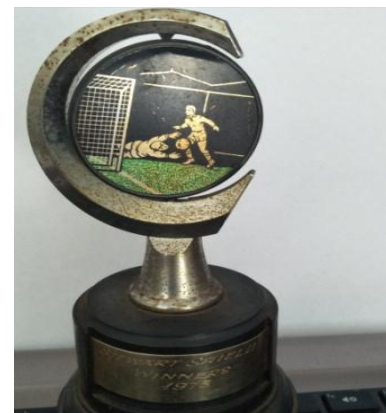
James Stewart Trophy