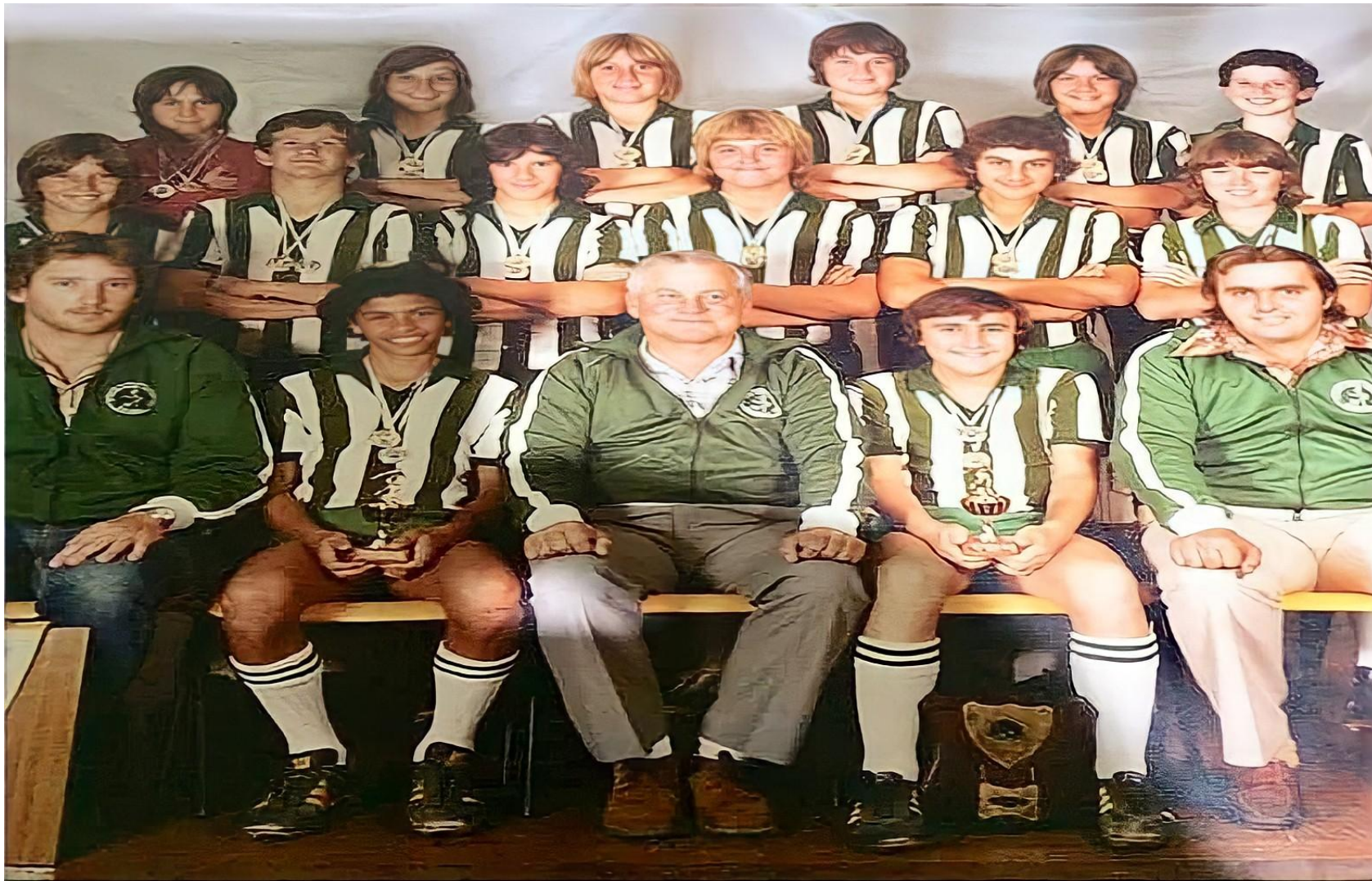
-1980- Under 14