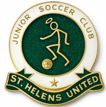
-1967- St Helens Under 13