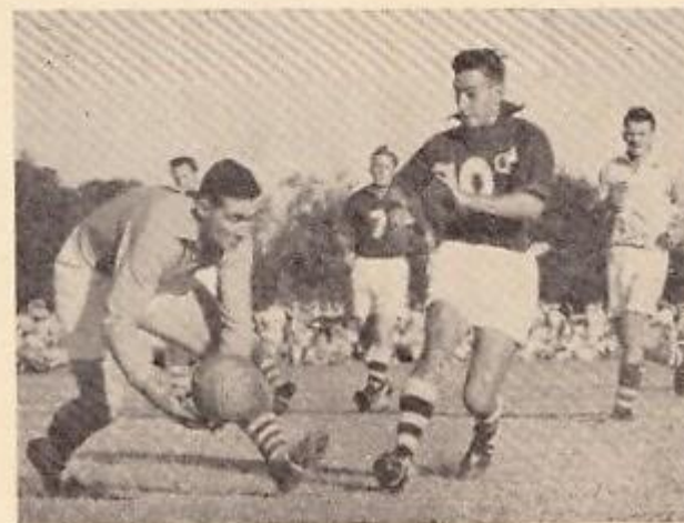
QUEENSLAND v. NEW SOUTH WALES — 1956