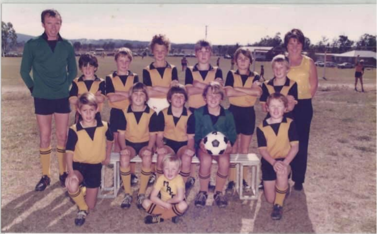
UNDER 11 - 4TH DIVISION TEAM