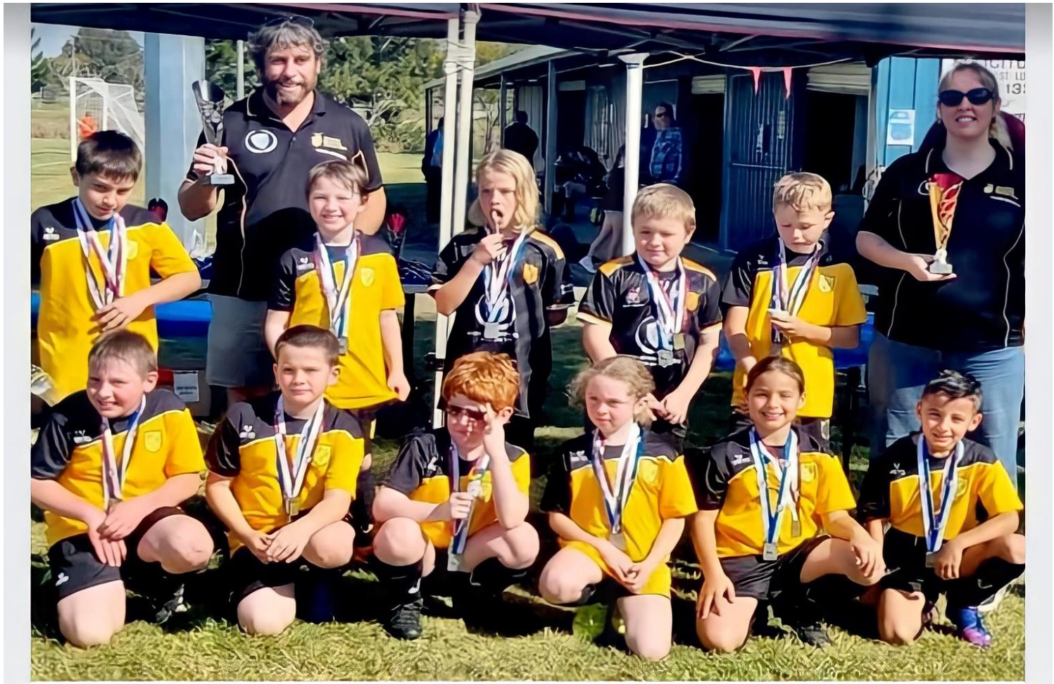
2021 Under 9