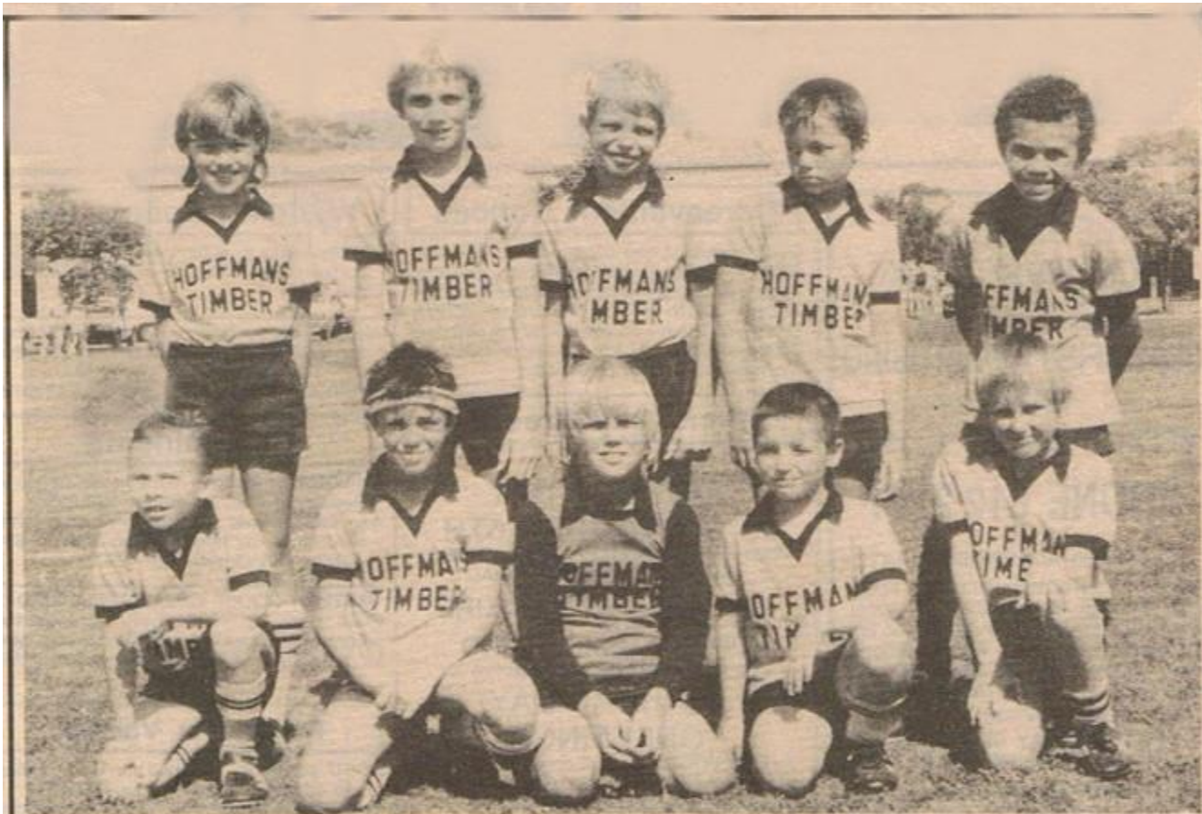
• The mighty Under 9 Bushrats