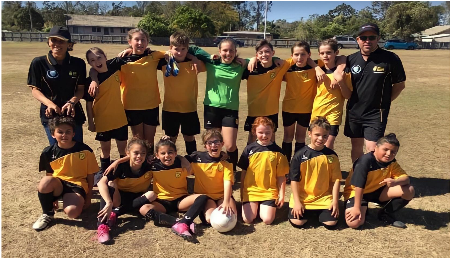
2021 Under 12