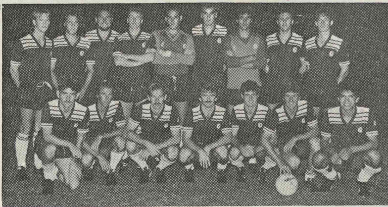
The Queensland squad which toured Fiji last year and scored two wins in three games, including a victory over the Fiji national side.

Indeed, 1987 could be the Year of the Maroon.