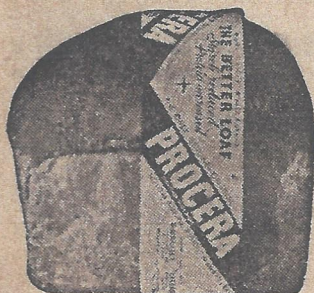
FULL OF NUTRITIVE PROTEINS