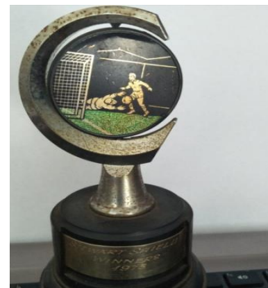
James Stewart Trophy