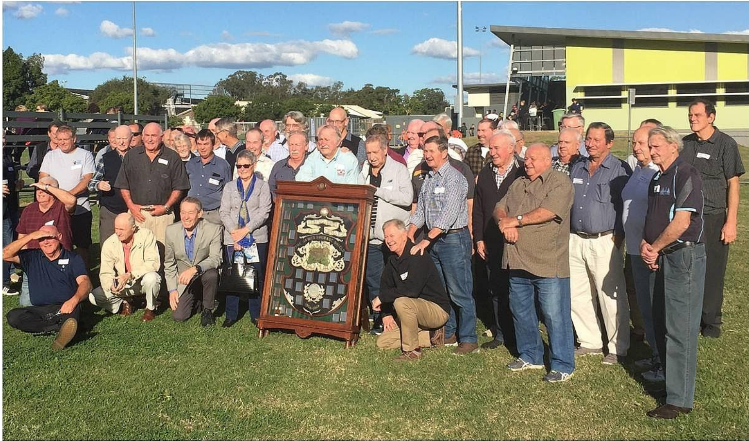
2021 Stewart Shield Winners Reunion