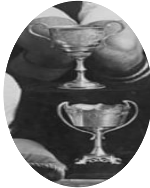
Nissan Cup/Green Cup