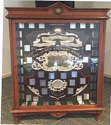
James Stewart Shield