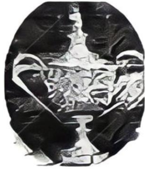
Ipswich Charity Cup