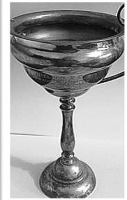
J Gordon Trophy