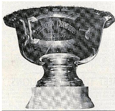
Brussasco Cup (Grand Final Winners)