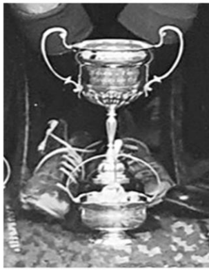
Cribb and Foote (Centenary Cup)