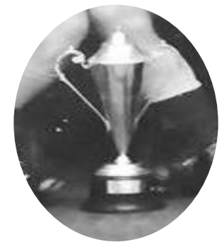
Johnny Fern Cup