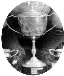
G H Price Cup