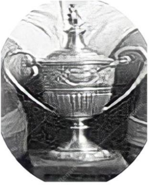
Ipswich Challenge Cup