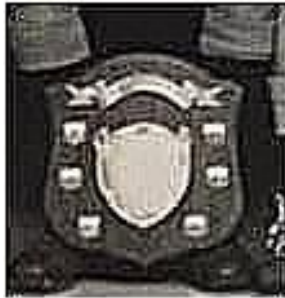
Tom Guthrie Shield