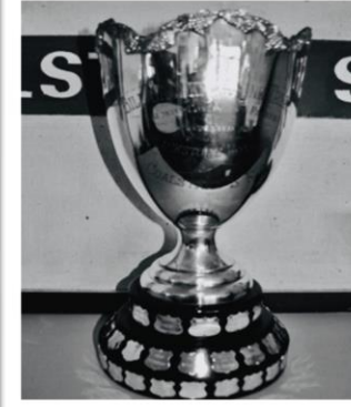
Bill xxxx Junior Trophy