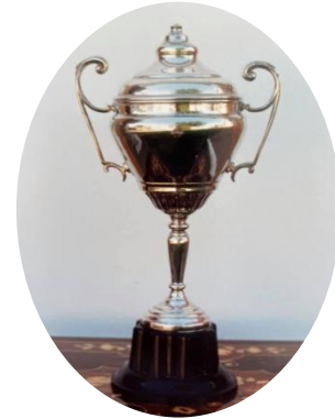
Harry Linning Trophy