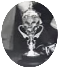
Johnny Peebles Cup