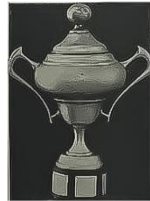
Gino Paris Cup