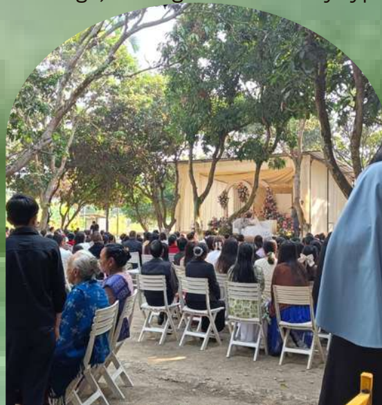
OPEN STAGE WITH LAWN Customizable wedding Reception and Event Area with open stage