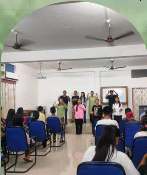
A/C TRAINING HALL Capacity 50 persons

The DAN Training Centre, situated at the Carmel HSS Campus in Chekiye Village, 4th Mile, offers a tranquil and fully equipped venue suitable for organizing a variety of events. It features residential accommodations for up to 80 guests, along with a spacious, secure parking area and an expansive, lush green catchment area. The centre includes both large and small halls, as well as an open-air stage, making it ideal for any type of events.