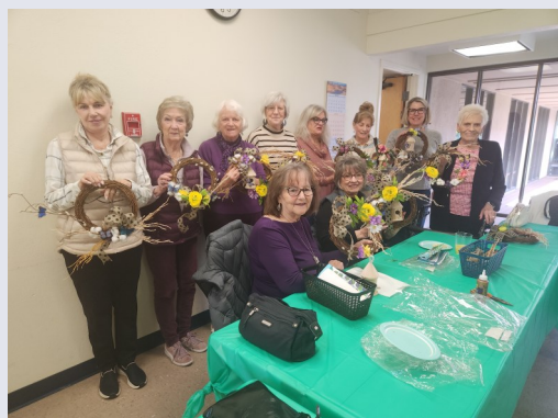
Wreath workshop participants showing off their lovely creations

April..... workshop on creating a spring wreath using natural materials...twelve participants created beautiful wreaths to hang on their doors or feature on their entrance walls to their homes.