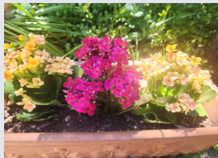
Pot of flowers from 2025 plant sale