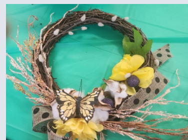
A beautifully creative