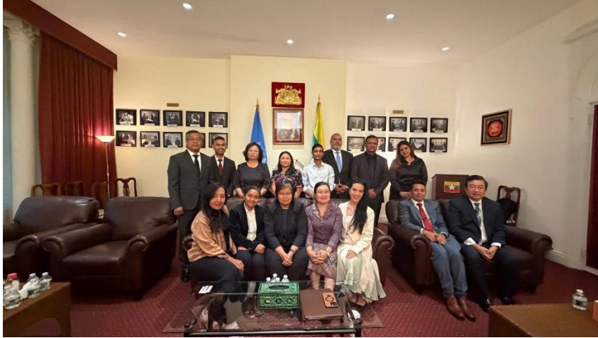
Director General of ARU was invited by NUG Myanmar in their New York office, a fruitful discussion was done with all stakeholders attending the meeting.