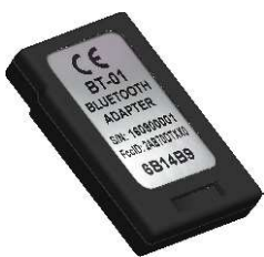
(Dimensions: 36x24x6.5 mm)

This is our newly designed Bluetooth adapter. By adding this adapter to some of our newly designed meters, it will equip these meters with the Bluetooth access capability.