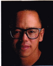
JEFFREY HULSE Photographer

From big adventures and family celebrations to four-legged friends and favorite pastimes and activities, it's your stories that bring Stroll Singletree to life. This magazine exists because of you - and for you. When neighbors contribute, the whole community becomes richer in connection, personality, and heart. Want to be part of it? Reach out to holly.proctor@n2co.com and share your story today!