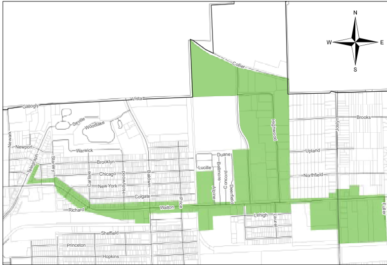
Walton Blvd. Overlay District Map