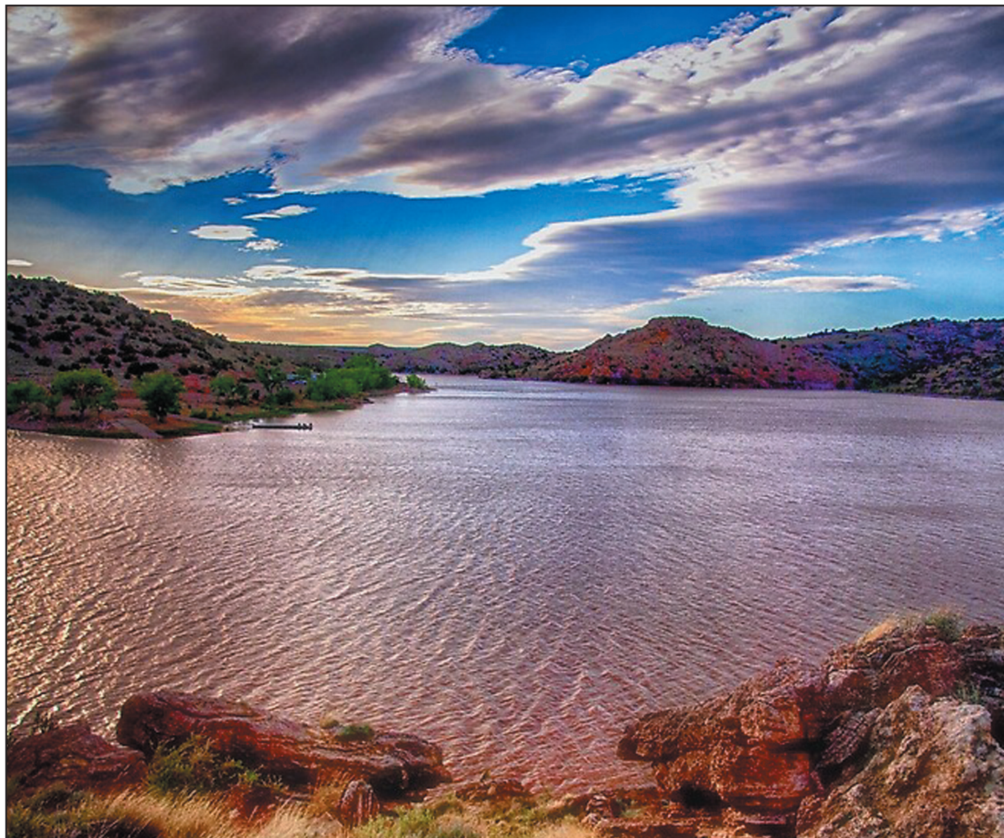
[Above: Lyman Lake State Park is located fifteen miles north of Wenima Valley. Next page: Along the San Francisco River, about thirty miles from Springerville, Arizona.]

LYMAN LAKE STATE PARK is the first recreational state park in Arizona. This 1,180 acre park encompasses the shoreline of a 1,500 acre reservoir. Lyman Lake is at an elevation of 6,000 feet and was created as an irrigation reservoir by damming the Little Colorado River in 1915. The lake is fed by melted snow from the slopes of Mount Baldy and Escudilla Mountain, the second and third highest mountains in Arizona. Water is channeled into this river valley from a 790 square mile watershed which extends into New Mexico. Because of its size, Lyman Lake is one of the few bod-