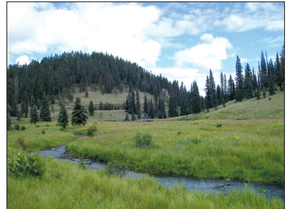
[Top: A Rainbow Trout . This species of fish was introduced to Arizona in 1898, and some fish may live as long as eleven years. Above: Upper Blue Campground , about seventeen miles from Alpine, Arizona is well known for fly-fishing.]

“To him, all good things—trout as well as eternal salvation—come by grace and grace comes by art and art does not come easy.”