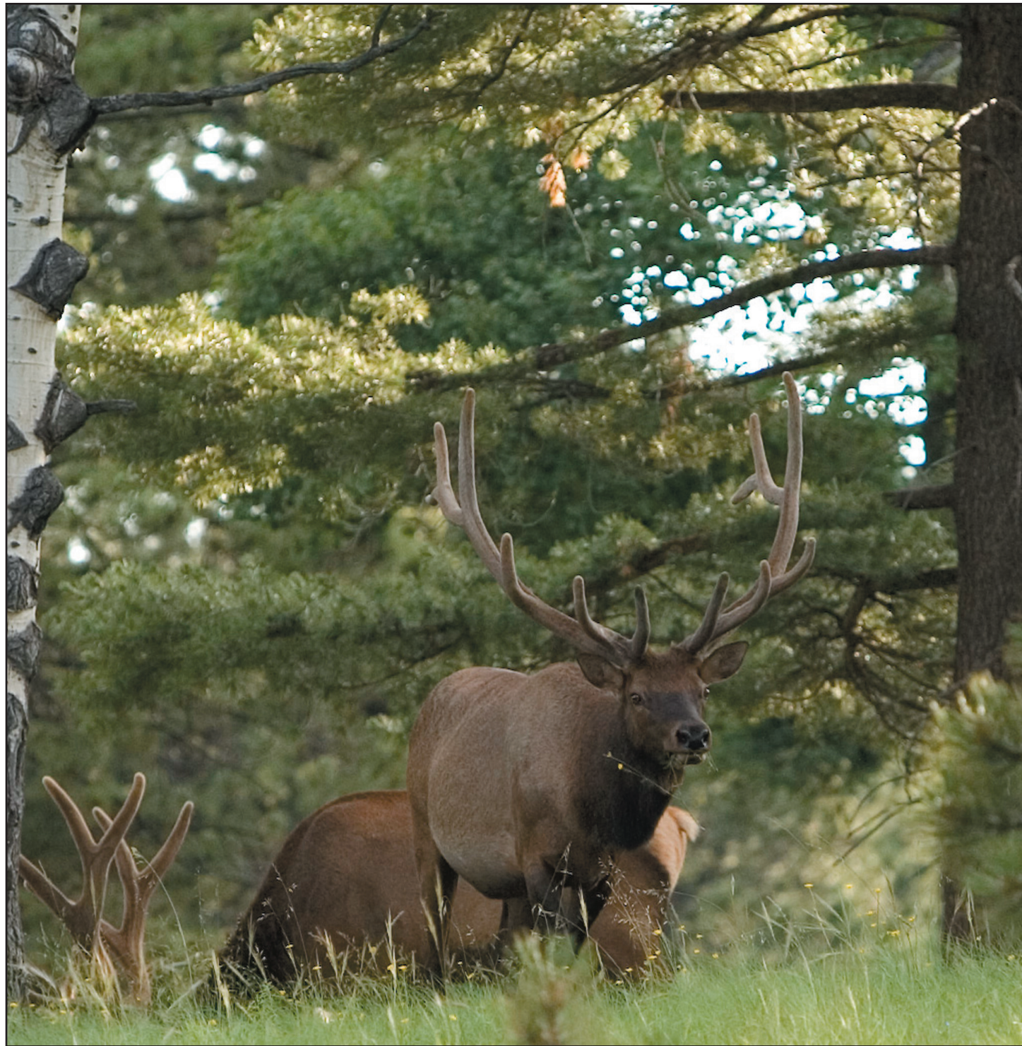
[Above: Several elk in the Apache-Sitgreaves National Forest. The forest surrounds Wenima Valley, Springerville-Eagar, and the adjoining area and is only a few minutes drive away.]

elk, deer, bighorn sheep, and turkey, as well as a variety of songbirds, waterfowl, small mammals, fish, amphibians and reptiles. There are opportunities throughout the forest for photographers, casual observers, hunters, and anglers.