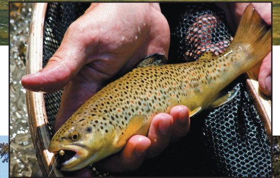
[Top: Fly Fishing is popular in the White Mountains. Excursions and one-on-one lessons are offered by seasoned fishermen in the area. Right: Brown Trout are found in the lakes and streams of the White Mountains. Below: In the Mount Baldy Wilderness . ]