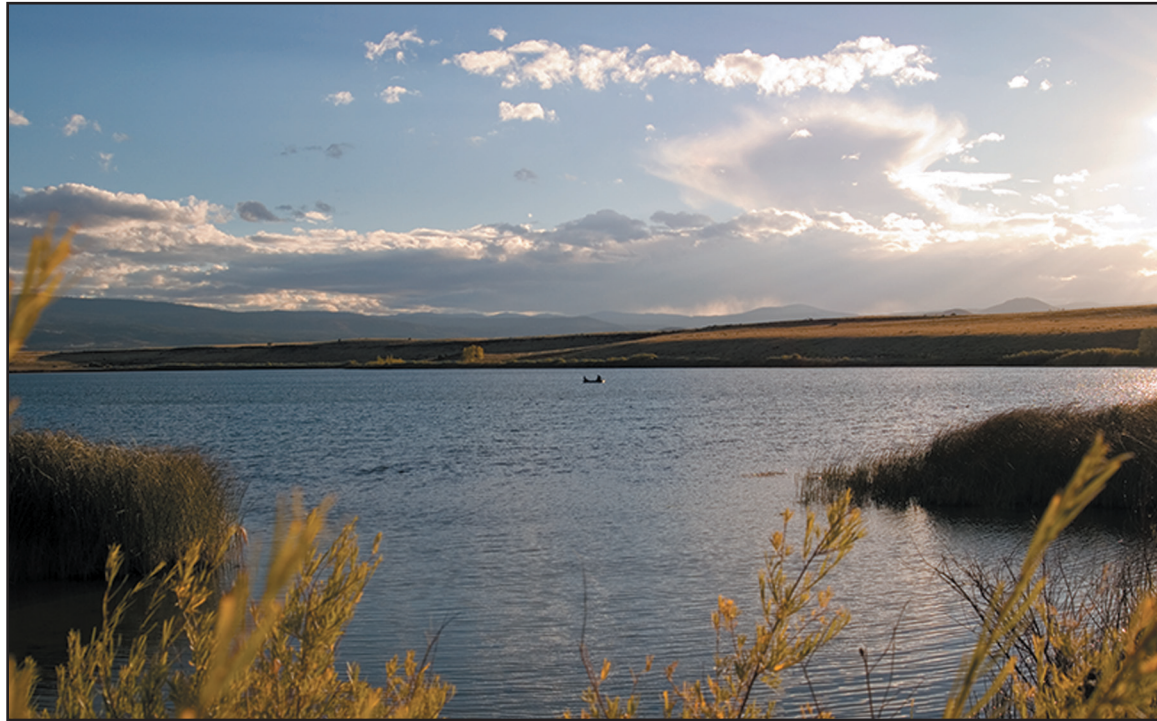
[Left: Becker Lake is literally just minutes from Wenima Valley. Known for large rainbow trout, the lake is legendary for hosting President Harry Truman for numerous fishing trips. Below: Big Lake is a popular location for both fishing and camping. Boat rentals are available seasonally. ]