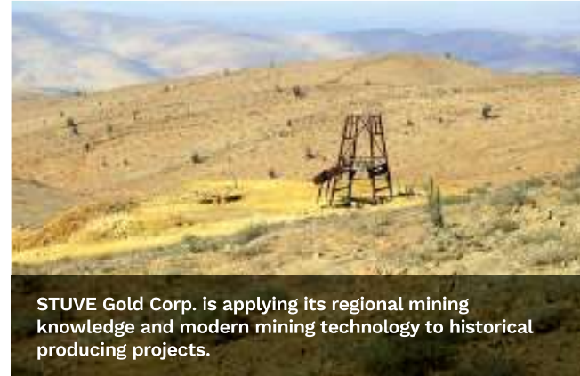
STUVE Gold Corp. is applying its regional mining knowledge and modern mining technology to historical producing projects.