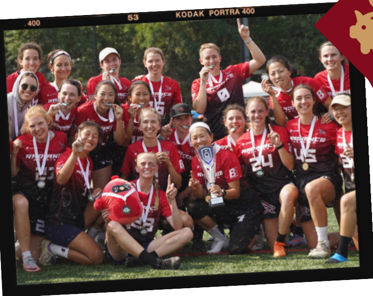
Radiance 2023 Revenue: $45,000

In 2023, the Radiance operated at a slight deficit of $5,000. To become revenue positive, the Radiance is working on increasing game day attendance and corporate sponsorships. Please see the following two figures breaking down the 2023 Radiance revenue and expenses.