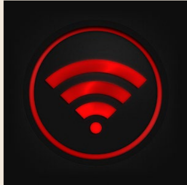
Swift Broadband Wi-Fi with CNX Router (International)