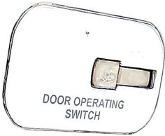
DOOR OPERATING SWITCH