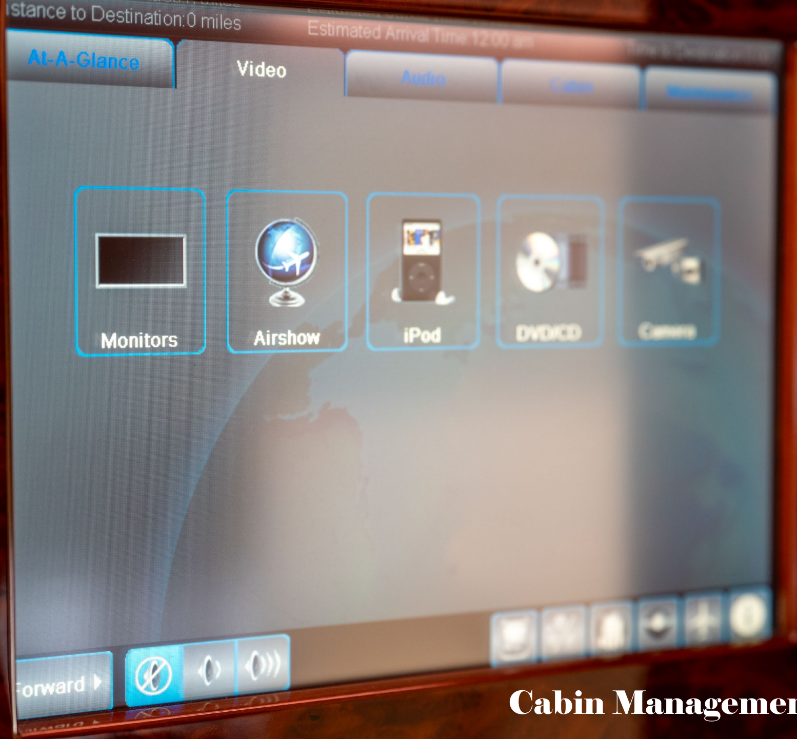
Cabin Management Control Screen