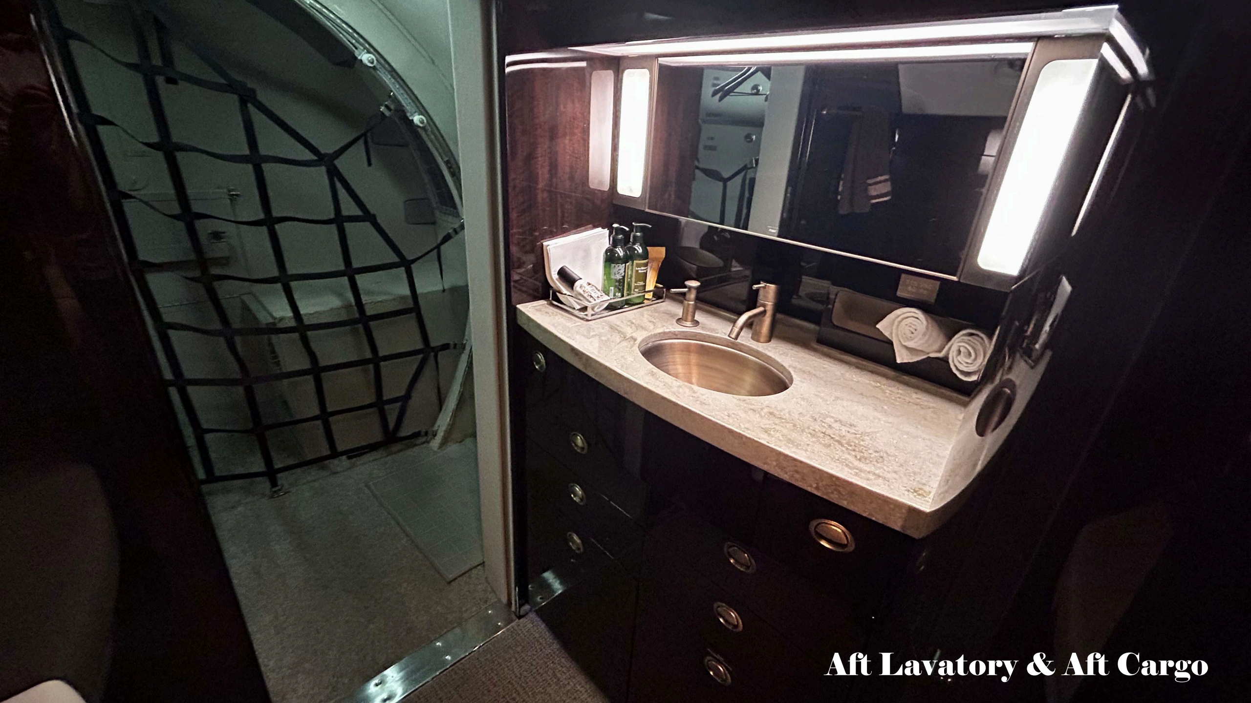
Aft Lavatory & Aft Cargo