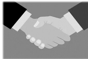
CUSTOM SOLUTIONS & CONTRACTS

Questions at: info@preparewithpcs.com PCS Form 2Z 03/2024