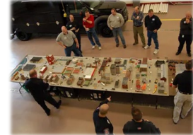
TABLETOPS & TESTING & EXERCISES (T2E)