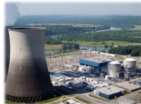
CRITICAL & SECURE INFRASTRUCTURE