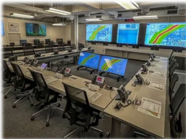
EMERGENCY OPS CENTERS