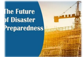
PRE & POST- DISASTER CONSTRUCTION