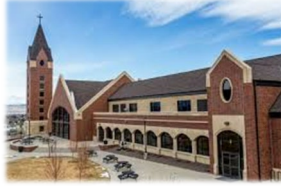
SCHOOLS & CHURCHES