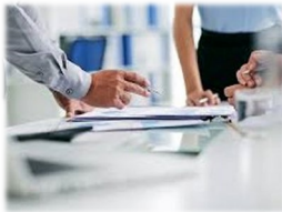
CONTINUITY & PLANS