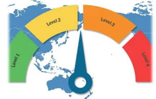
TRAVEL & EVENTS