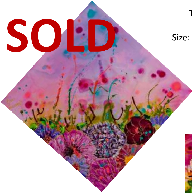
Title: 'Spring Flowers' 2019 Medium: Acrylic Size: 90cm x 90cm deep edge canvas Price: $375 SOLD