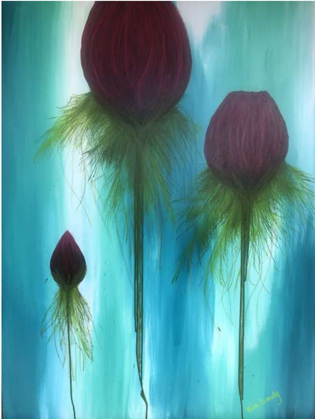
Title: 'Tamed Rubescents' 2020 Medium: Acrylic, Ink and Oil Pastel Size: 91cm x 122cm x 3.5cm deep edge canvas Price: $400