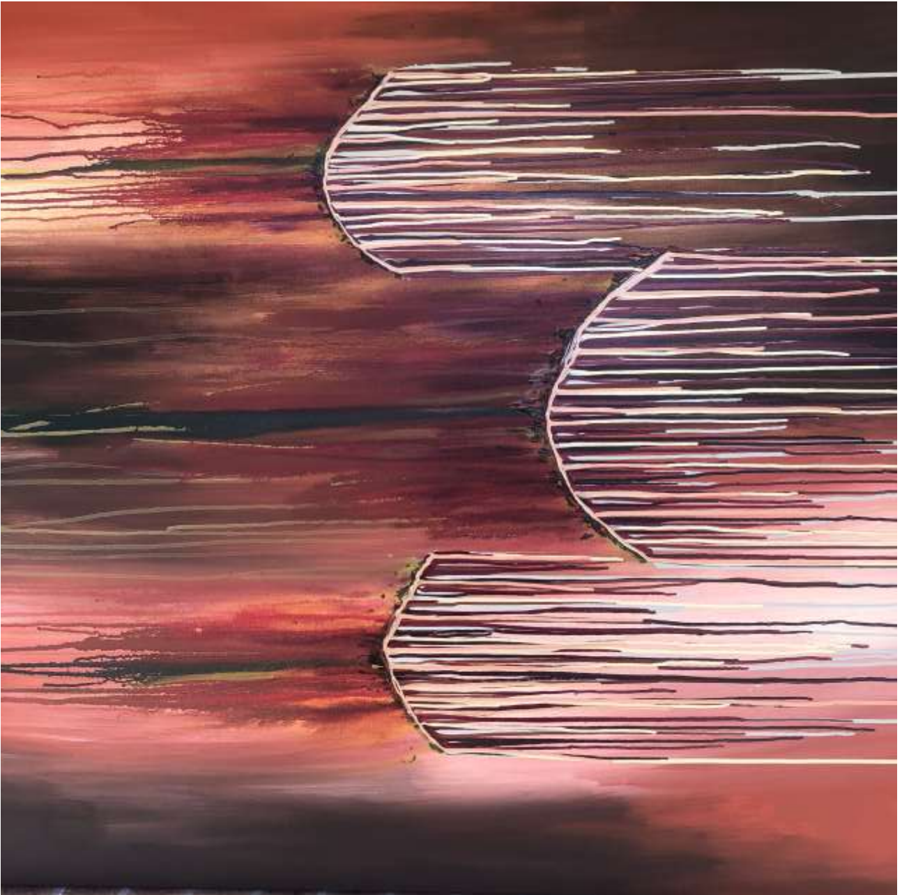
Title: 'Paths to the Future' 2020 Medium: Acrylic Size: 122cm x122cm deep edge canvas Price: $550