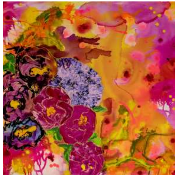
Title: 'Inked Roses' 2019 Medium: Acrylic Size: 90cm x 90cm deep edge canvas Price: $375 SOLD