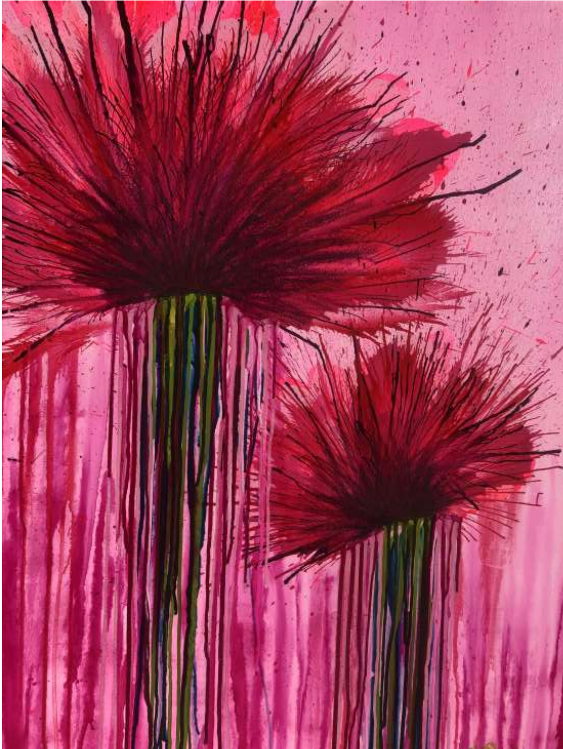
Title: 'Hot Petals' 2020 Medium: Acrylic, Ink, Oil Pastel Size: 76cm x 101cm deep edge canvas Price: $300