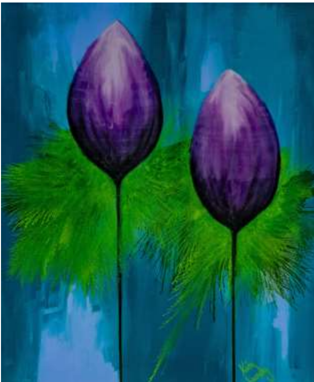
Title: 'Violet Buds' 2020 Medium: Acrylic, Ink and Oil Pastel Size: 50cm x 60cm x 3.5cm deep edge canvas Price: $100