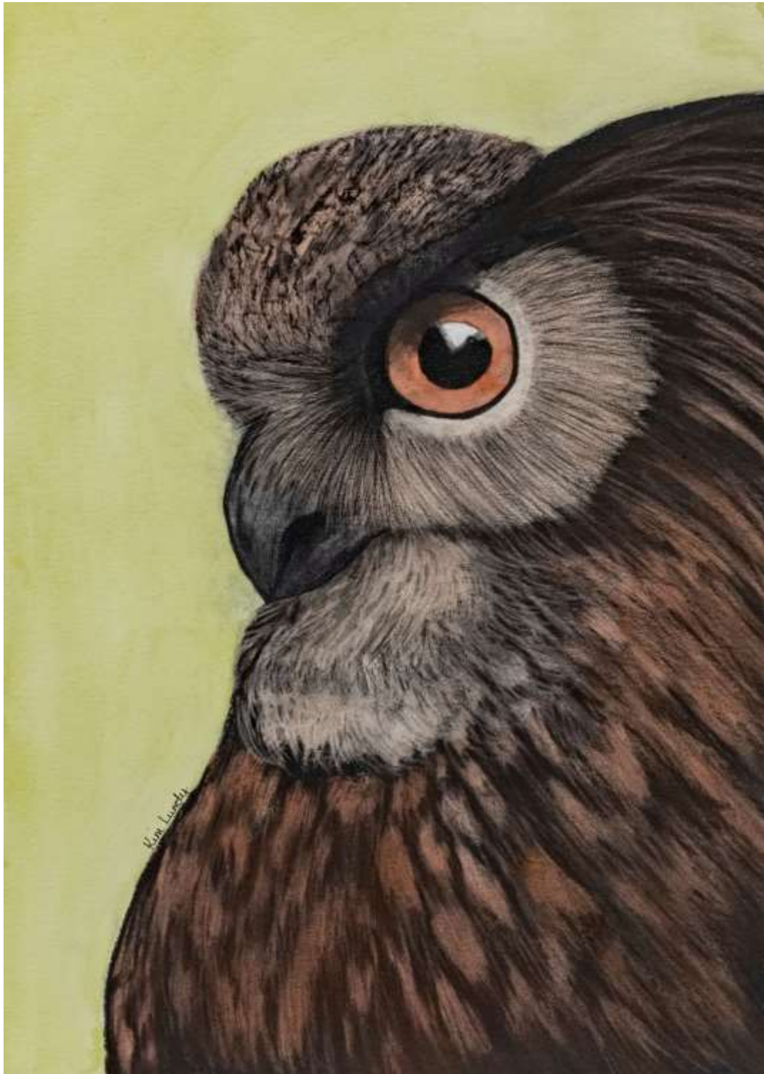
Title: 'Otto the Owl' 2021 Medium: Charcoal and Ink on Paper Matt plus 3cm natural wood frame Size: Drawing size - 71cm x 51cm Framed size - 81cm x 61cm Price: $500