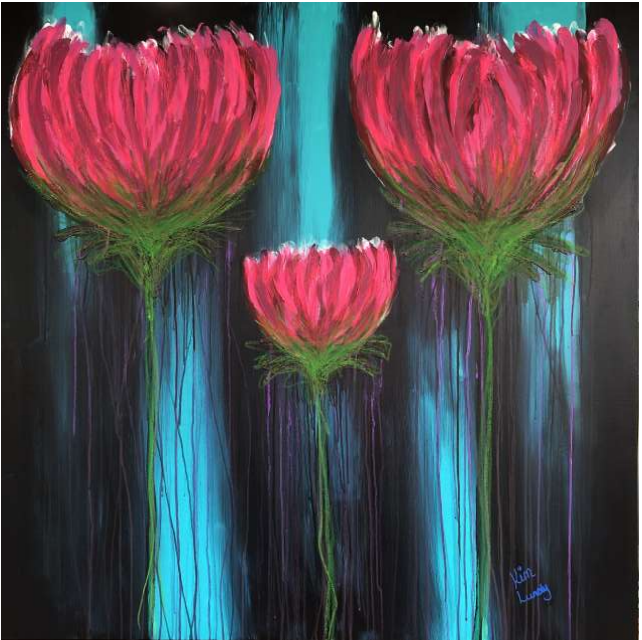
Title: 'Pink Thrice' 2020 Medium: Acrylic, Ink & Oil Pastel Size: 122cm x122cm deep edge canvas Price: $575