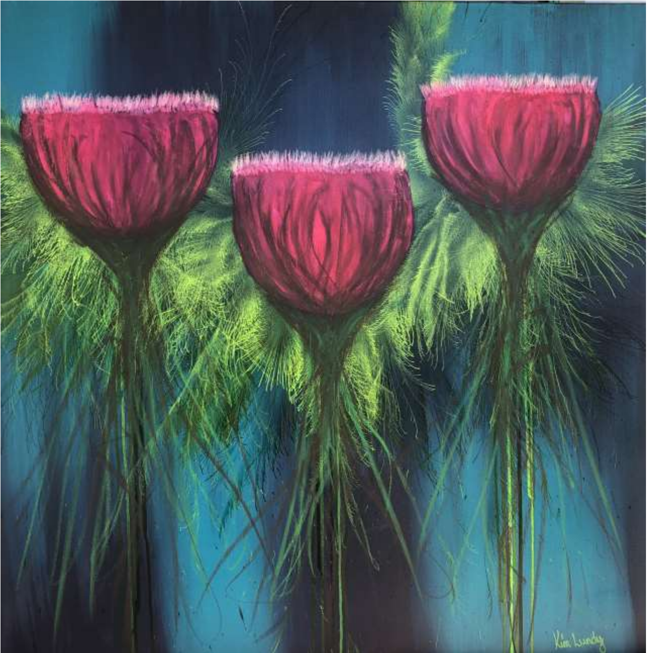
Title: 'Wild Rubescents' 2020 Medium: Acrylic Ink and Oil Pastels Size: 102cm x 102cm x 3.5cm deep edge canvas Price : $500 SOLD