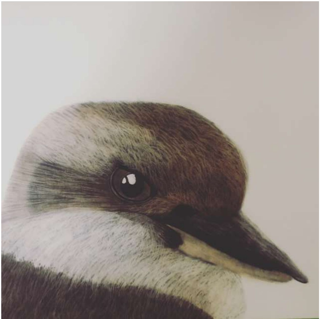
Title: 'Kane the Kookaburra' 2021 Medium: Charcoal and Ink on Paper Matt plus 3cm natural wood frame Size: Drawing size - 71cm x 51cm Framed size - 81cm x 61cm Price: $500