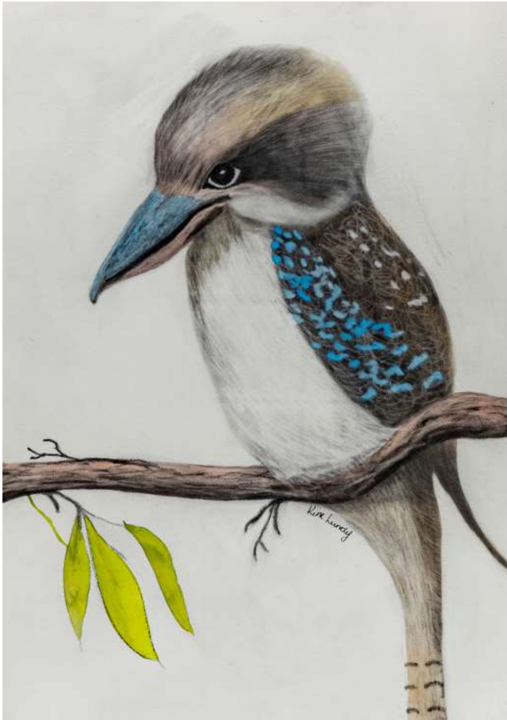
Title: Juvenile Kookaburra 2021 Medium: Charcoal and Ink on Paper Matt plus 3cm natural wood frame Size: Drawing size - 71cm x 51cm Framed size - 81cm x 61cm Price: $500