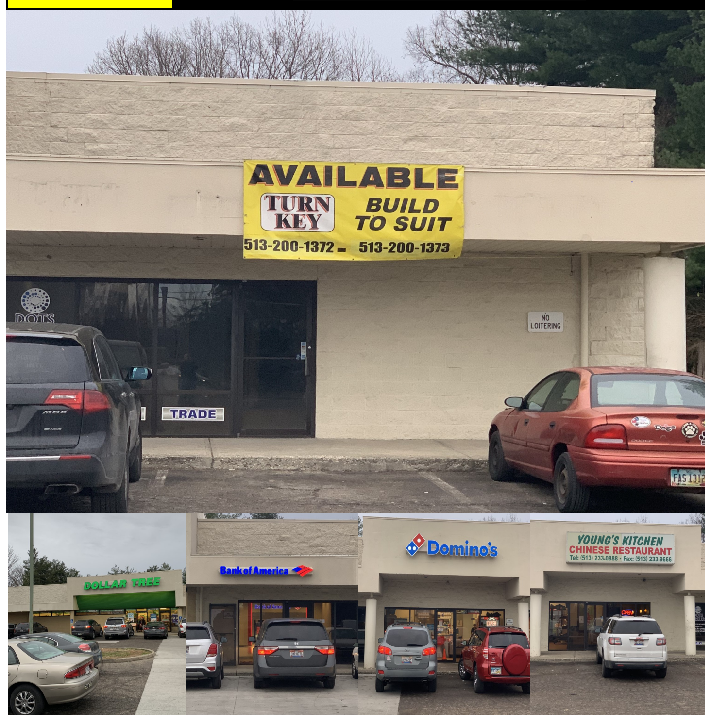
© 2009 Turn Key Commercial Real Estate Services, LLC. This information has been secured from sources we believe to be reliable, but we make no representations or warranties, expressed or implied, as to the accuracy of the information. Buyer must verify the information and bears all risk for any inaccuracies; this information is subject to errors, omissions, corrections, price change, prior sale and withdrawal from the market without notice.