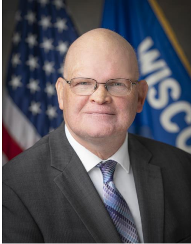
Dan Feyen State Senator 20 th Senate District