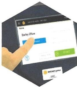
Intuitive Color Touchscreen

When you buy a DICKEY-john ® GAC ® 2700-AGRI you get all the dependability and value you expect from DICKEY-john products. Like all DICKEY-john products, the GAC ® 2700-AGRI is designed and manufactured in the USA, and supported worldwide.