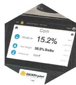
Easy-to-Read Results Screen