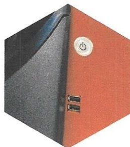
Front USB Ports Accommodate Keyboard and Mouse Plug In