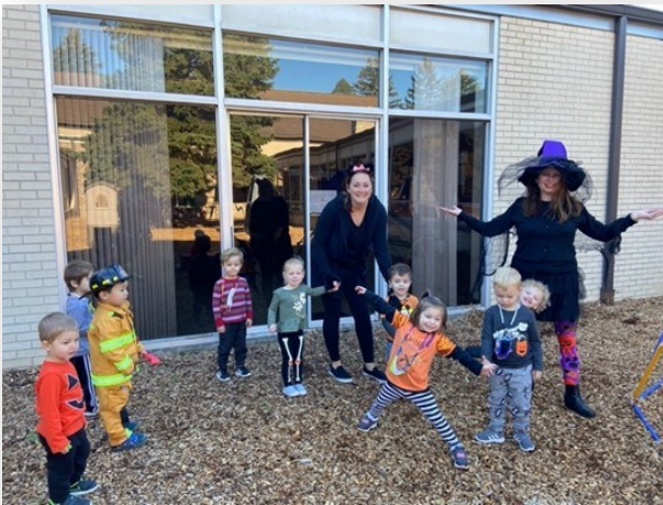
2's class enjoying the playground after their Halloween Parade

RBCNS, LLC is in full-swing and having a great time being back in the building. We are all working hard at keeping each other safe and healthy while still learning every day! In Pre-K we have worked on some units about Fall, Fire Safety, Apples and more! We are learning how to write our names and our numbers. In our 3s class we worked on opposites, recognizing our name, and some fine motor skills. Our 2s are hard at learning how to separate from our parents as well as learning to share with others and painting with all different types of materials. We have been very busy, and we also just had our Halloween Parade outside with some amazing weather. We are looking forward to our Thanksgiving break as well as all our fun activities leading up to our Christmas Break! We appreciate all the love and support from-RBC!!