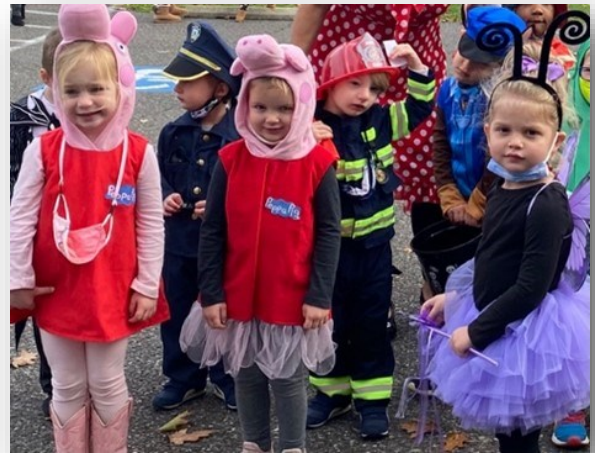
Some of our 3's at the Halloween Parade