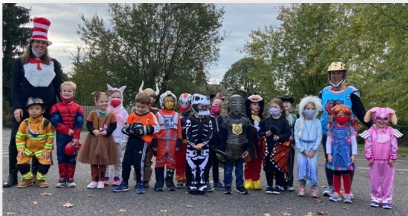
Pre-K Class at the Halloween Parade