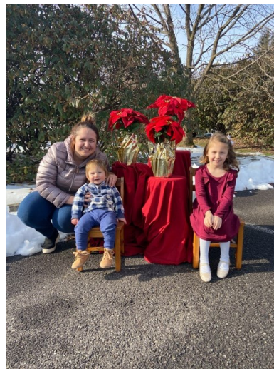
Christmas Social Meet-up