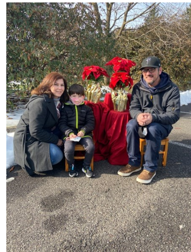
Christmas Social Meet-up