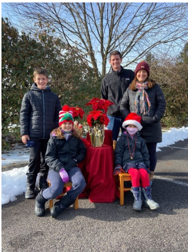
Christmas Social Meet-up