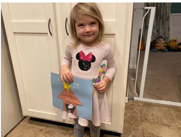
First Nativity by the 2s/3s