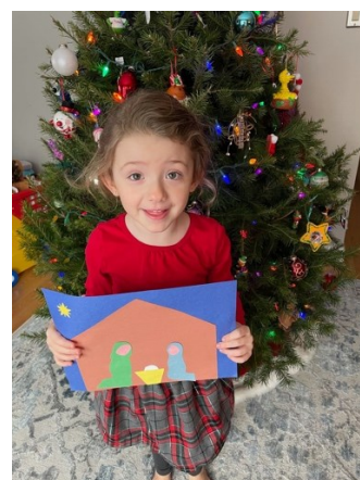
Pre-K/Pre-K+ The First Family