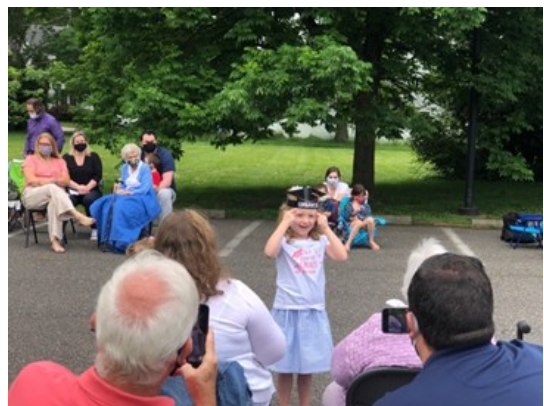
One of our graduates in her cap and shirt!