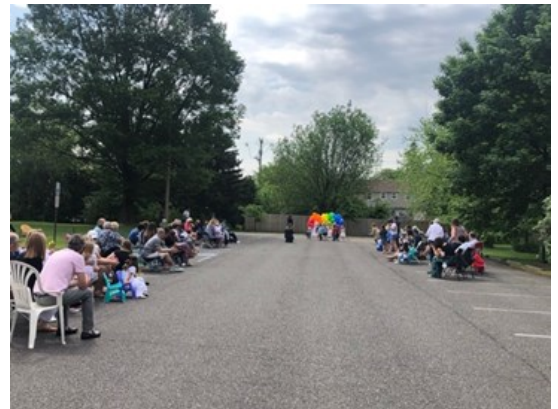
All the families at our Graduation/Moving Up Ceremony