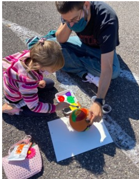
Social Meetup— Pumpkin Painting