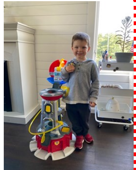
Show-and-Tell Paw Patrol