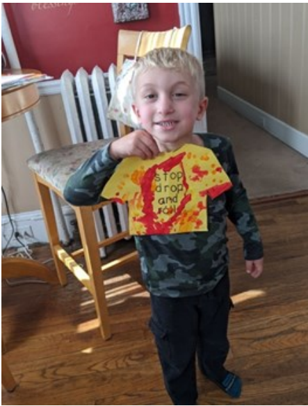
Fire Safety— Stop, Drop and Roll