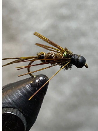
Bill Lucia, President Thomas Jefferson Chapter of Trout Unlimited

Step One Materials: #14 dry fly or nymph hook, black tungsten bead to fit hook size, small copper wire, Pheasant tail fibers. Black or brown 6-0 or 8-0 thread