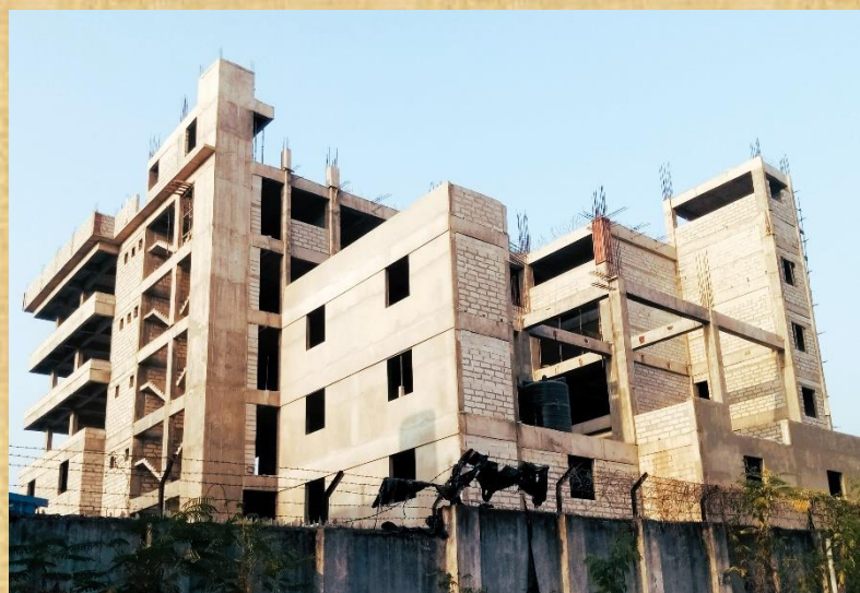
RMC PERFORMANCE CHEMICAL PVT LTD (JALGAON)