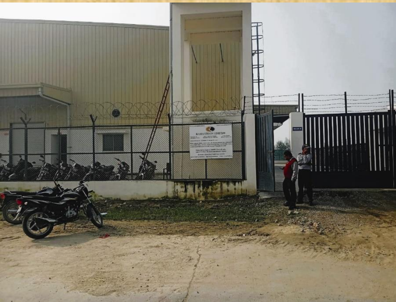
RAMA VISION LIMITED KASHIPUR (UTTARAKHAND)