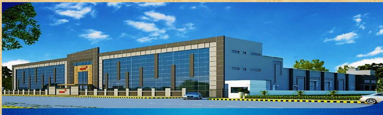
LUMAX ANCILLARY LIMITED