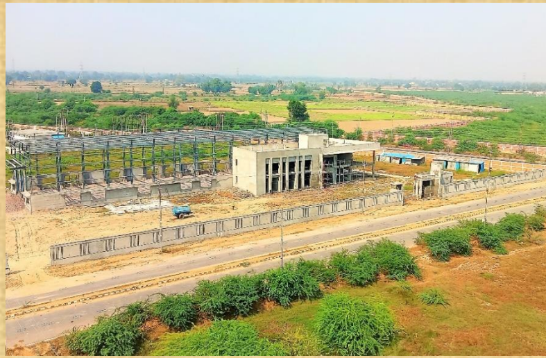
INTERPUMP HYDRAULICS INDIA PVT LTD. (Uttarakhand)