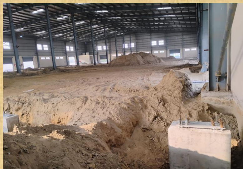
MITTAL ELECTRONICS SONIPAT (HARYANA)