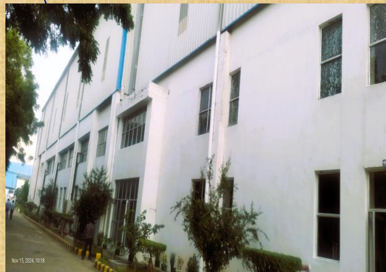
JBM GREEN ENERGY SYSTEMS PVT LTD. BAWAL (HARYANA)