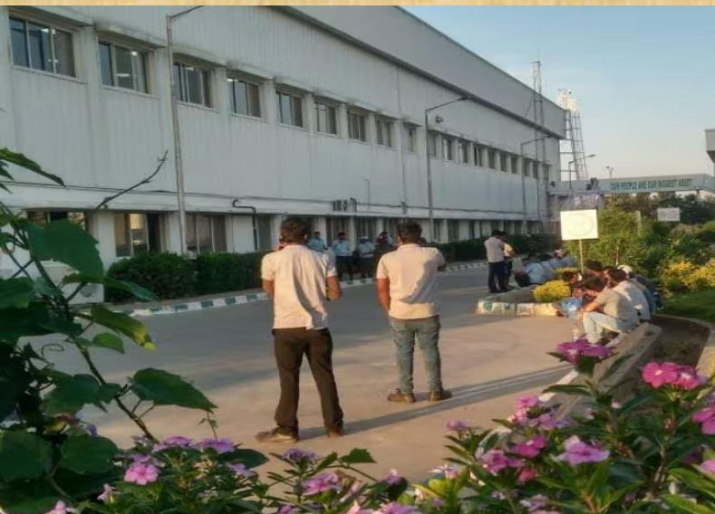
LUMAX AUTO_TECHNOLOGIES LTD. NARSAPUR KARNATAKA