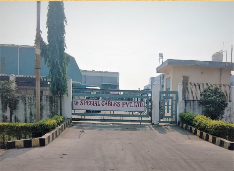
SPECIAL CABLES PVT.LTD (UTTARAKHAND)