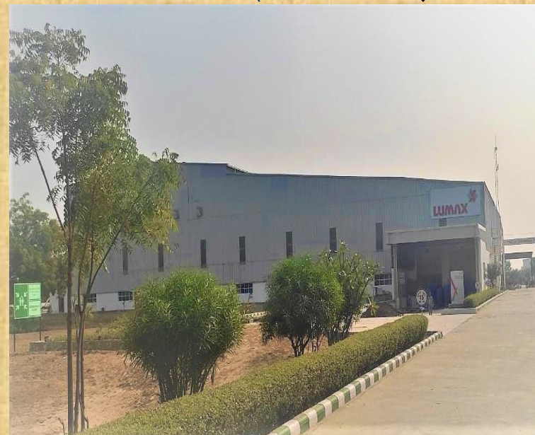
LUMAX INDUSTRIES LTD SANAND (GUJARAT)