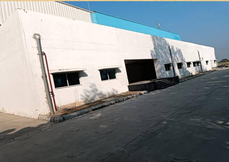
LUMAX INDUSTRIES LTD SANAND (GUJARAT)