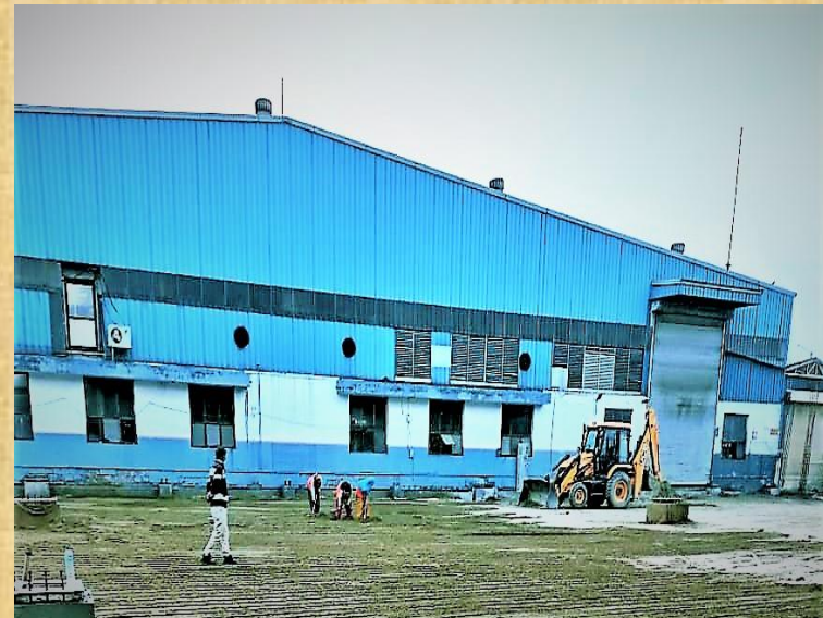
ENDURANCE TECHNOLOGIES LTD UTTARAKHAND