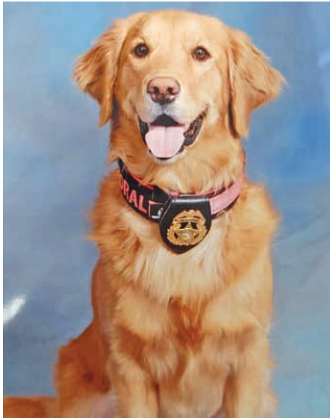
Monroe County Sheriff's K9 Coral.

C: If I'm not working, I get eight hours, I sleep a lot.