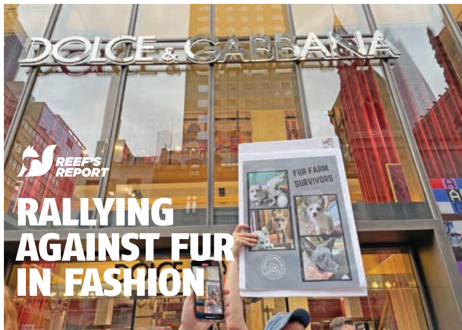
A picture of Reef and foxes that found sanctuary in Key Largo is held up during a protest against fur in fashion in New York City last weekend.