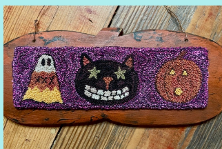
New Punch Needle Design