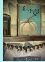
Happy Fall Canvas Painting