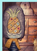
Painted Halloween Ornaments