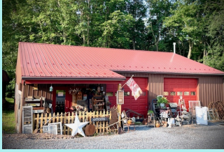
Did a little Fall Decorating!