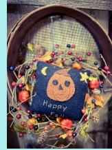
Happy Fall Applique