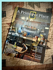
A Primitive Place Fall 2025