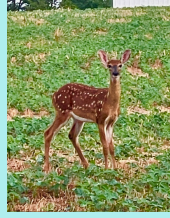
Aw, this baby...