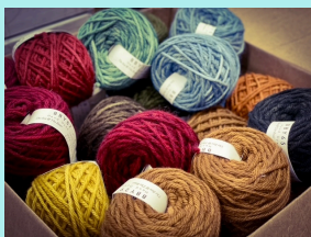
100% Wool Yarn

And as always, we are open by appointment! :)