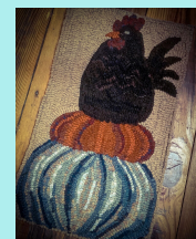
New rug design!