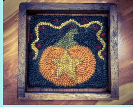
Oxford Punch Class