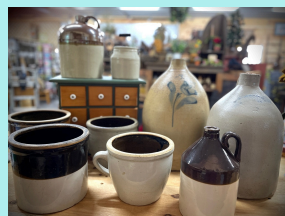
Beautiful Stoneware & Antiques