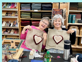
These ladies LOVED the Happy Heart kit!