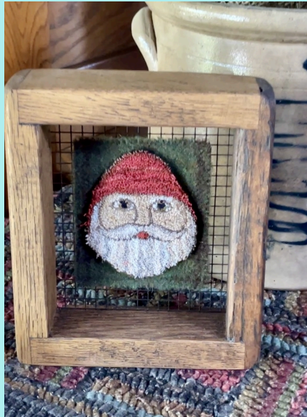
Santa Claus Punch Needle