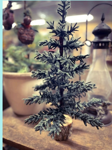
Wooly Pine Tree