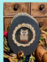
Painted storage box