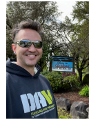
Coast to Coast: Chapter 14 members reunite years later