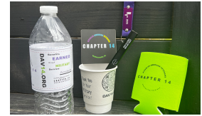
DAV14's #outreach products expand- data suggest its working!