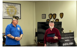
DAV CHAPTER 14 PRESENTS APPRECIATION AWARDS

LOCAL CHAPTER HQ EXPANDS COMMUNITY PARTNERSHIPS HELPING TO IMPROVE LIVES OF DISABLED VETERANS