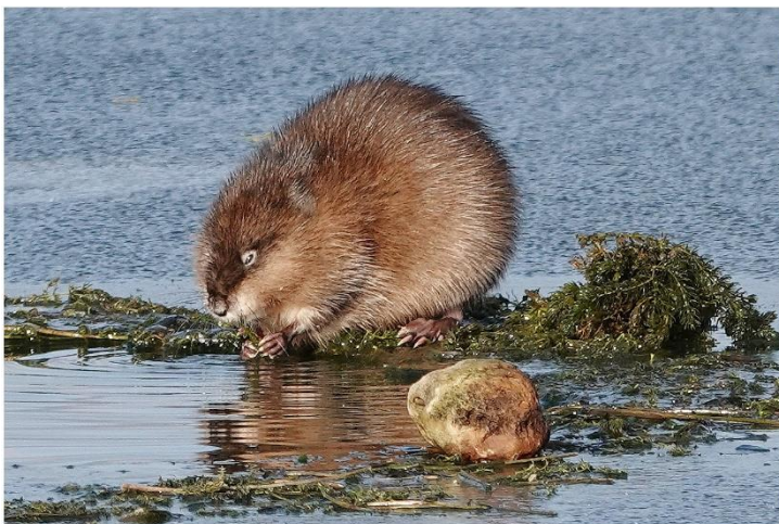
“Chowing Down by Hole in the Ice” – Carl Stineman—Class B Honorable Mention