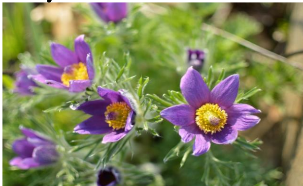
Pasque Flower by Eileen Klehr