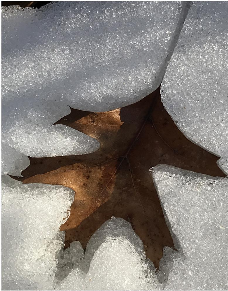
Leaf Impression – Eileen Klehr ---Honorable Mention Class B