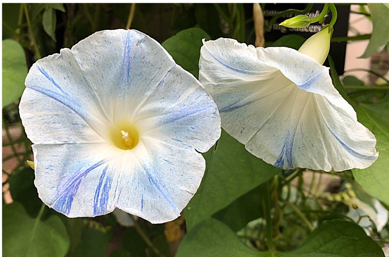
“Glories” – Tom Sievers --Honorable Mention Class B