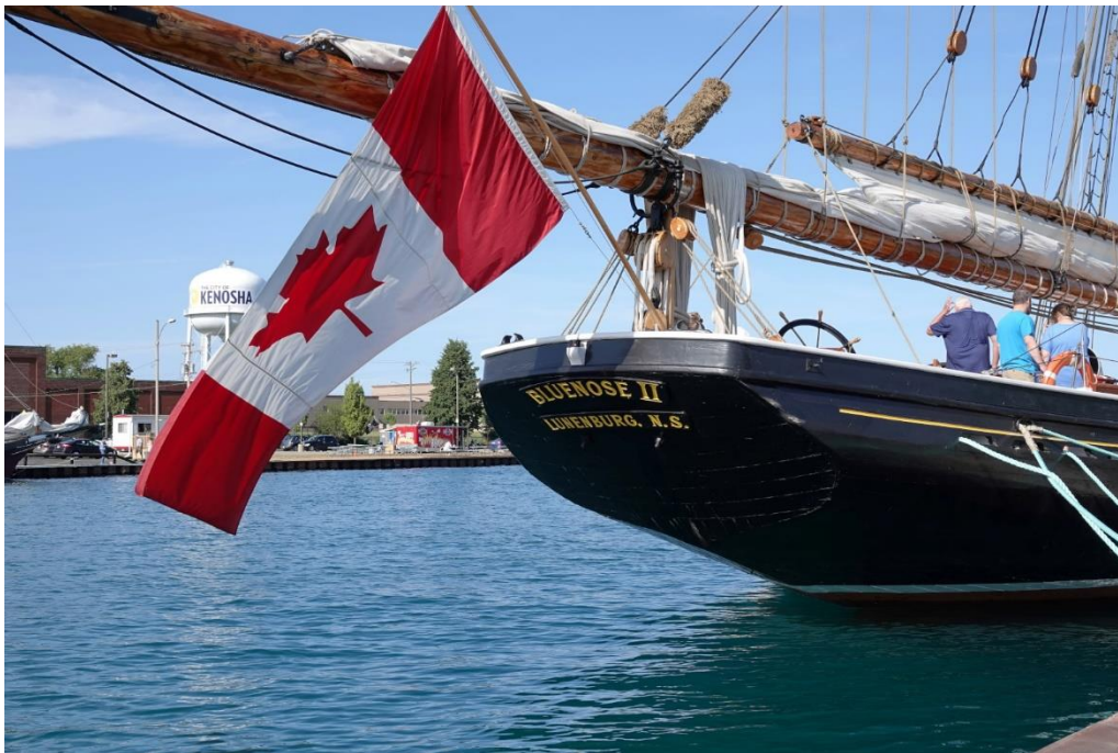
Bluenose II stern