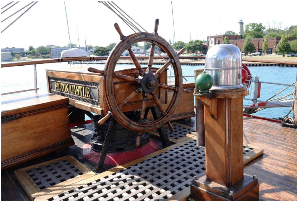
Picton Castle wheel