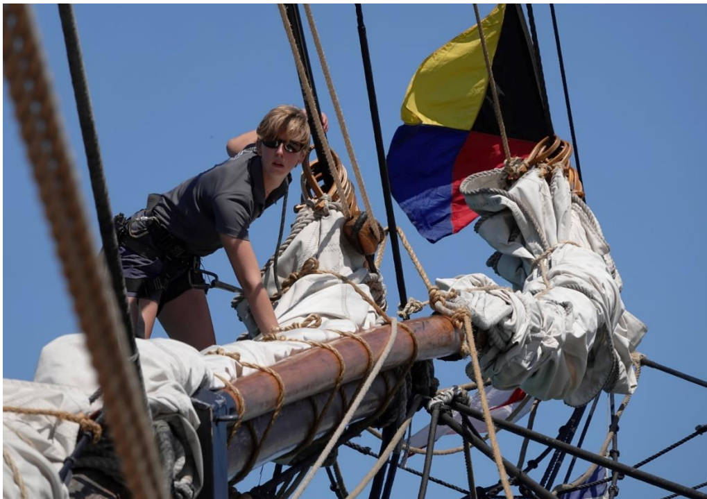
Working the bowsprit on Niagara