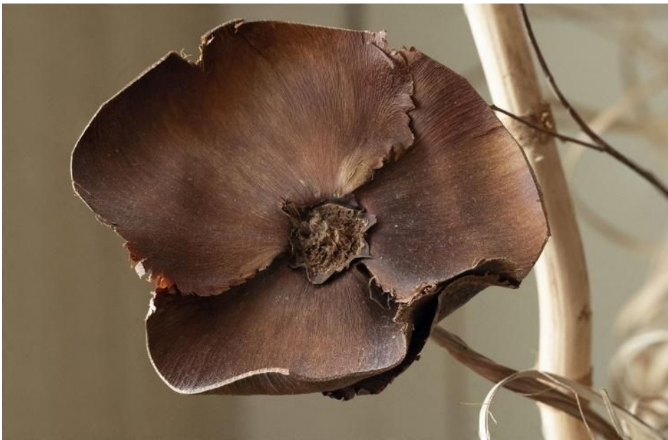
Macro Photography