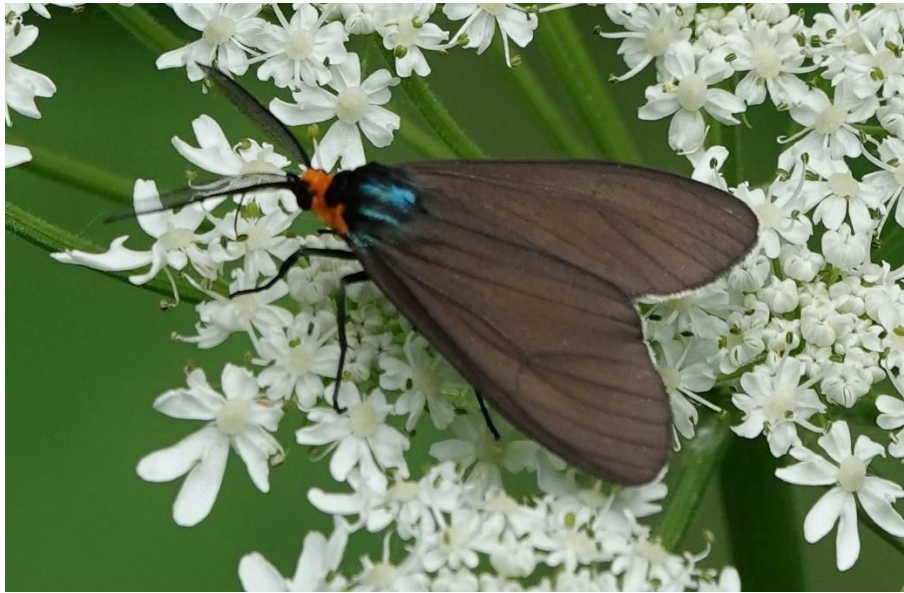
Moth on a Cow Parsnip