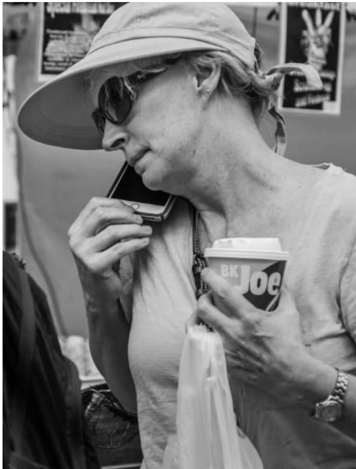
Street Photography – Bob Marx