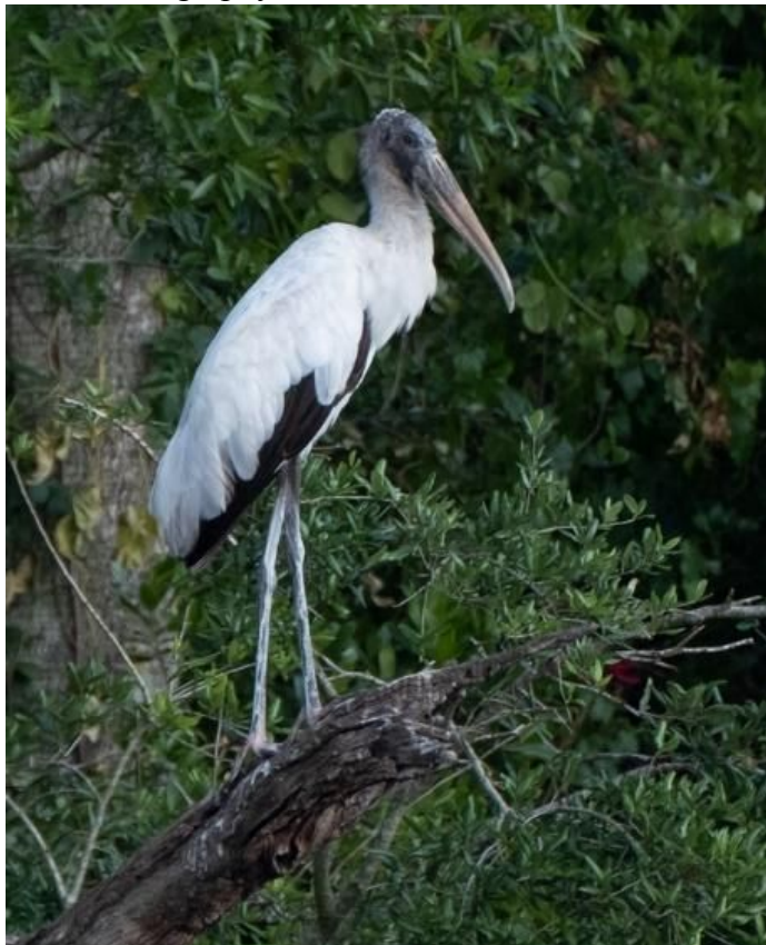
Wildlife Photography - Bob Marx