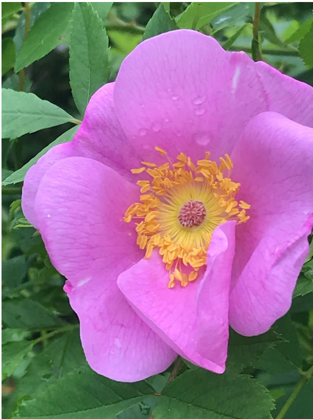
Wild Rose - Eileen Klehr