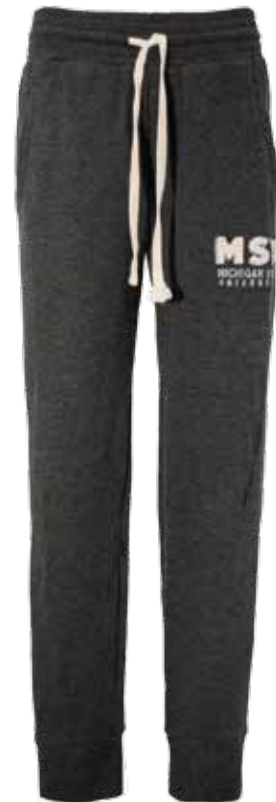
GRAPHIC # 207