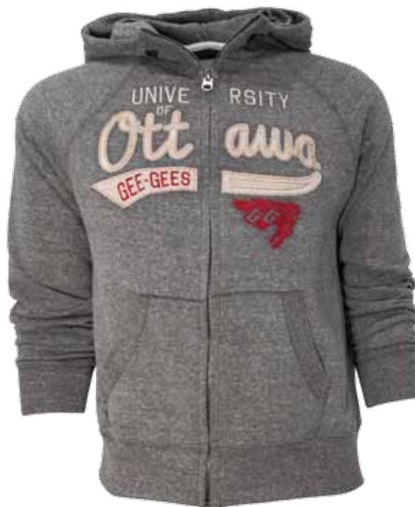
GRAPHIC # 172

*XXL available in select colours for this item.