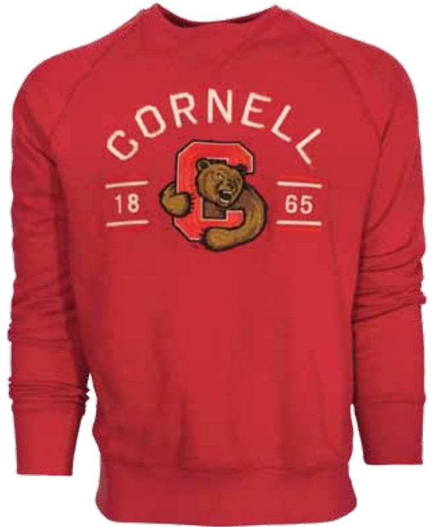
GRAPHIC # 144 MOD