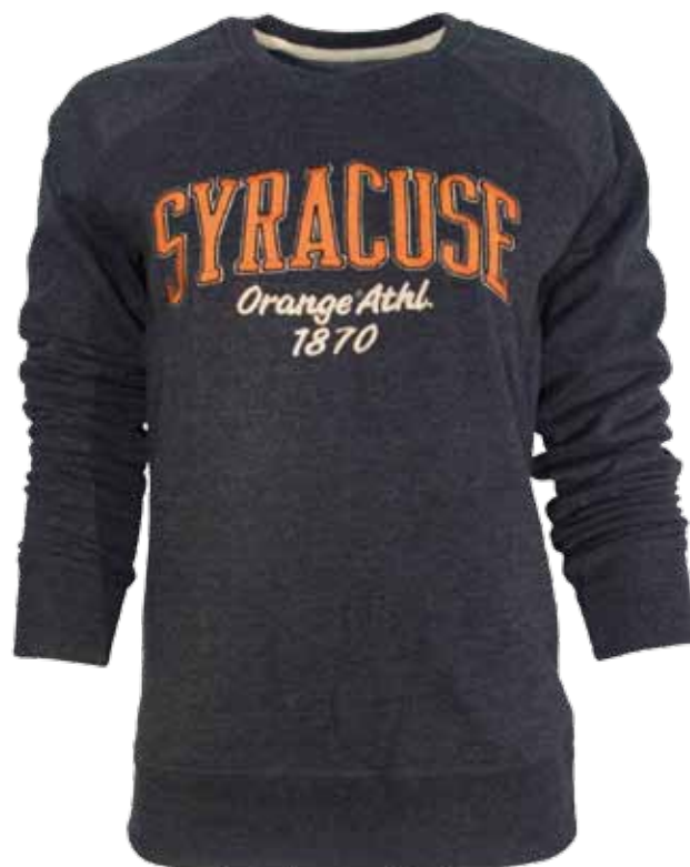
GRAPHIC # 176