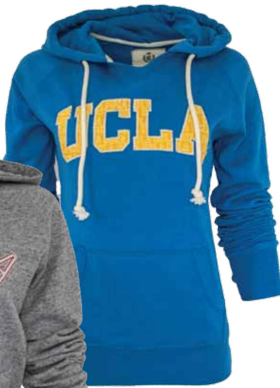
GRAPHIC # 226