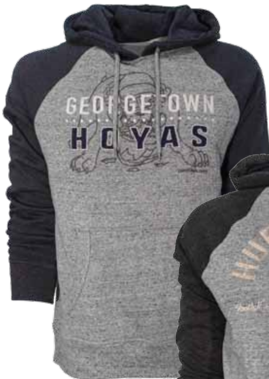
GRAPHIC # 257