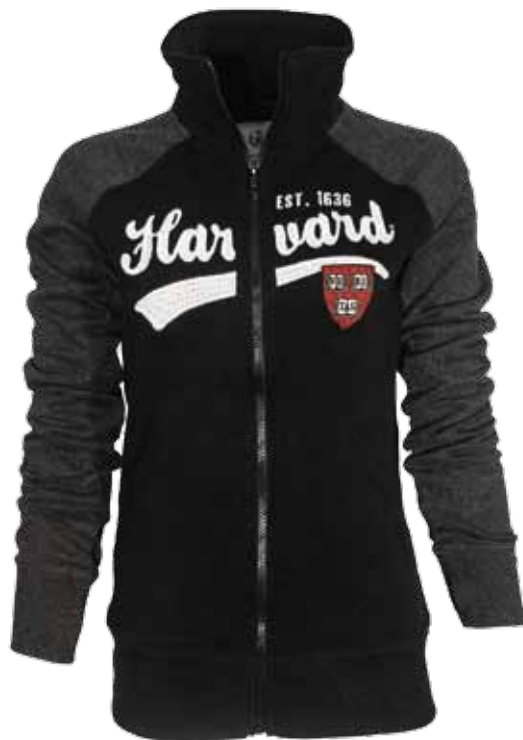
GRAPHIC # 55