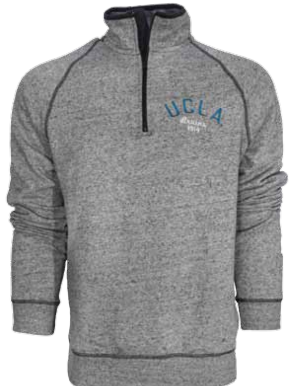
GRAPHIC # 137