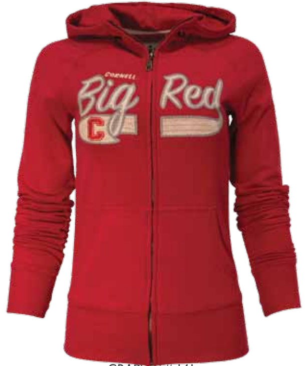
GRAPHIC # 141