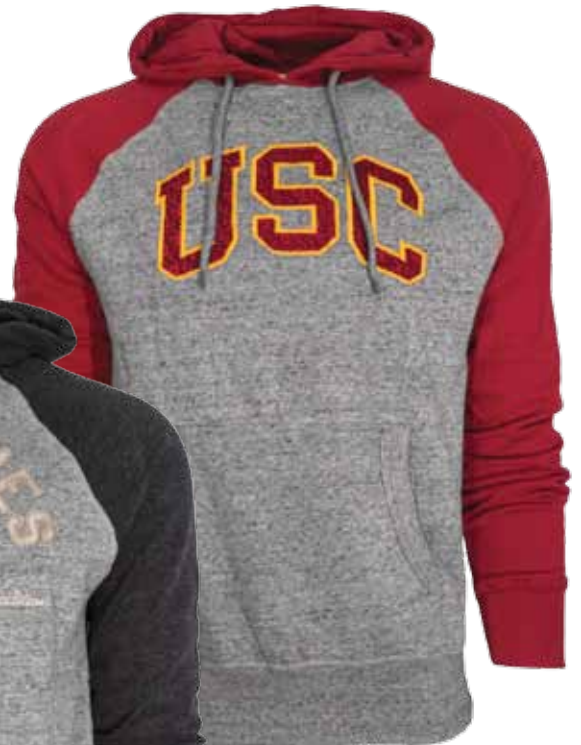
GRAPHIC # 226