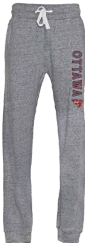
GRAPHIC # 278