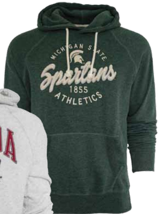
GRAPHIC # 49