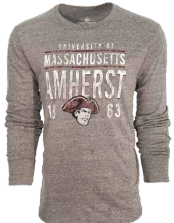
GRAPHIC # 260