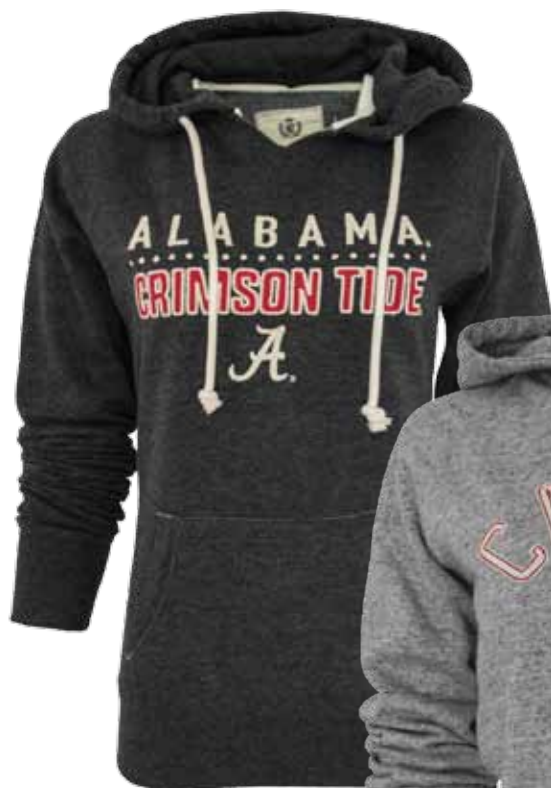
GRAPHIC # 257 MOD