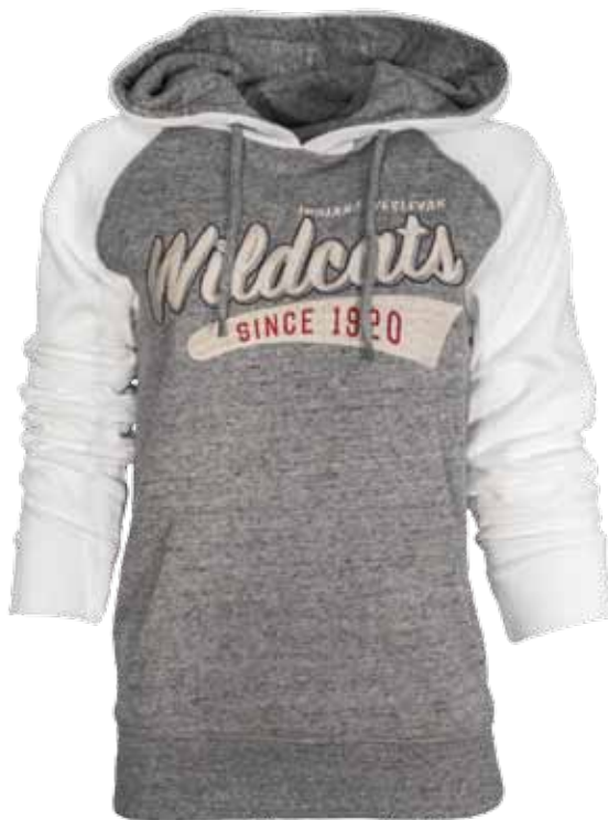
GRAPHIC # 135