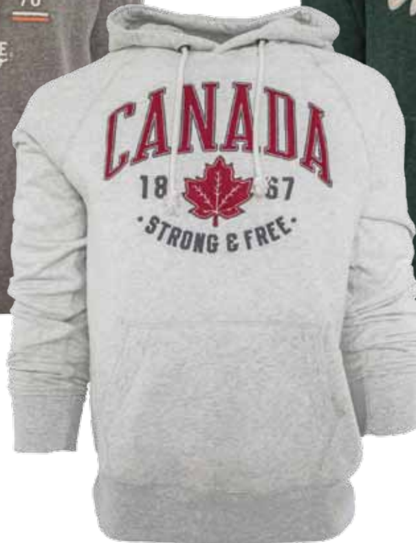
GRAPHIC # 50