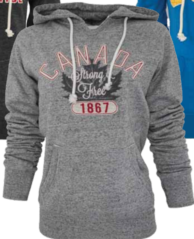
GRAPHIC # 327