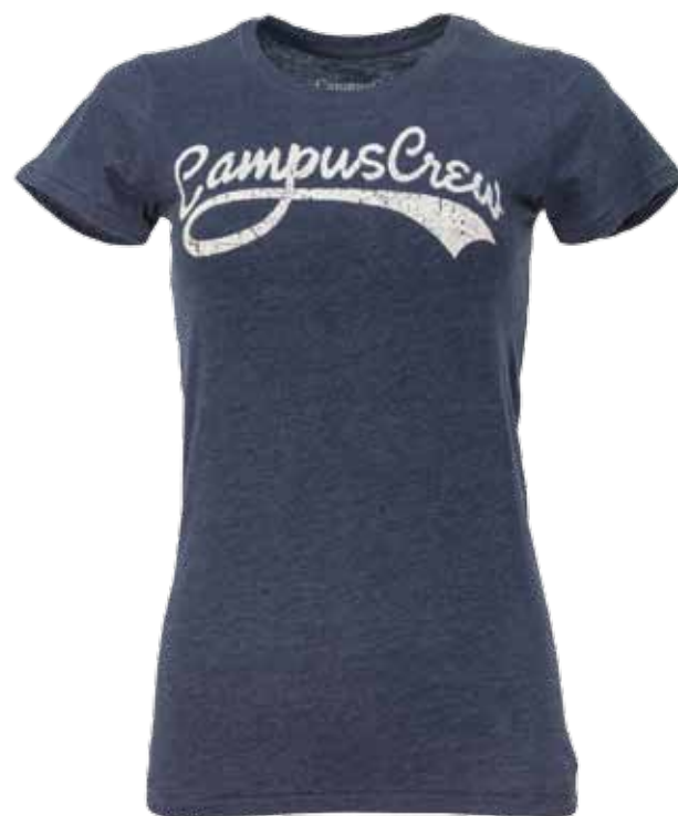
GRAPHIC # 210