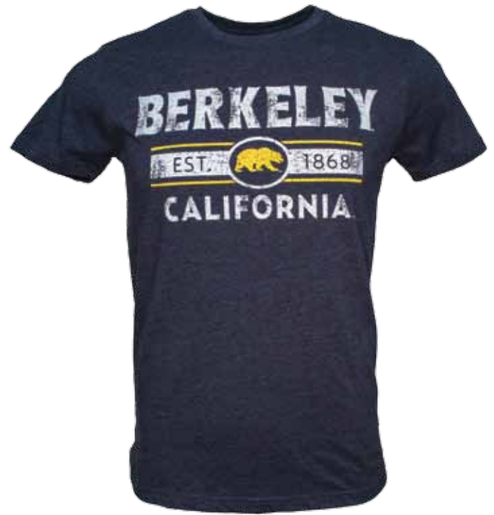
GRAPHIC # 341