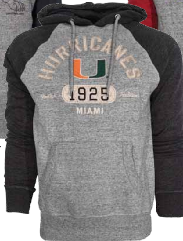
GRAPHIC # 327