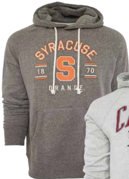
GRAPHIC # 144