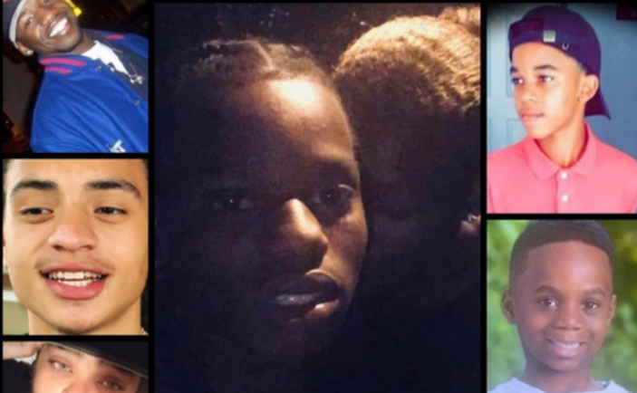
A Sun For my Sun