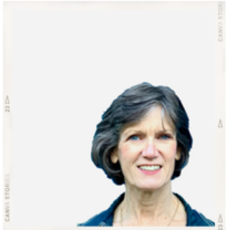
Zena Consulting Founder / Owner

If you enjoy learning about different ethnic cultures the Northwest is a marvelous place to live.