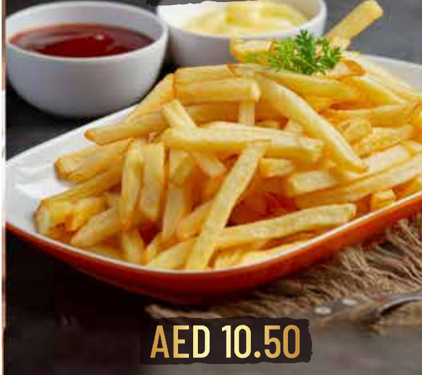
بطاطس مقلية French Fries