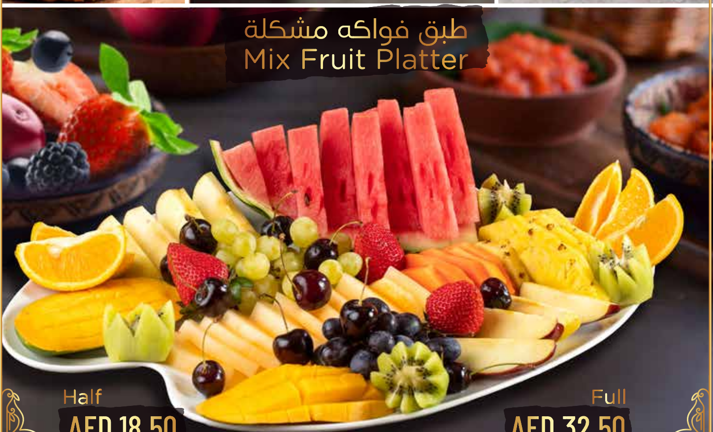
طبق فواكه مشكلة Mix Fruit Platter