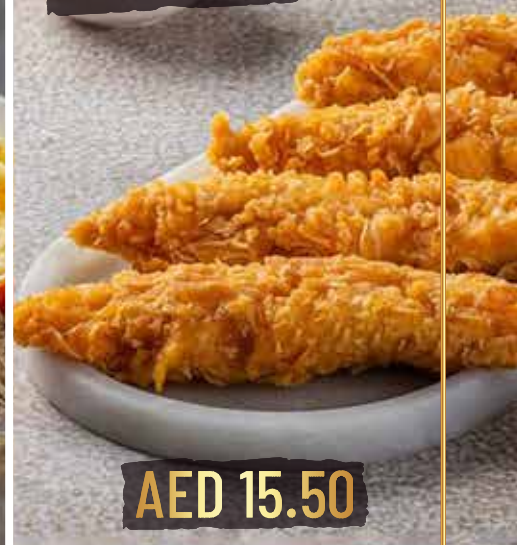
اصابع الدجاج Chicken Fingers