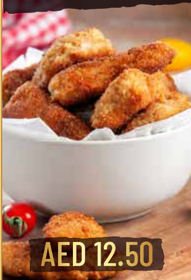
قطع الدجاج Chicken Nuggets